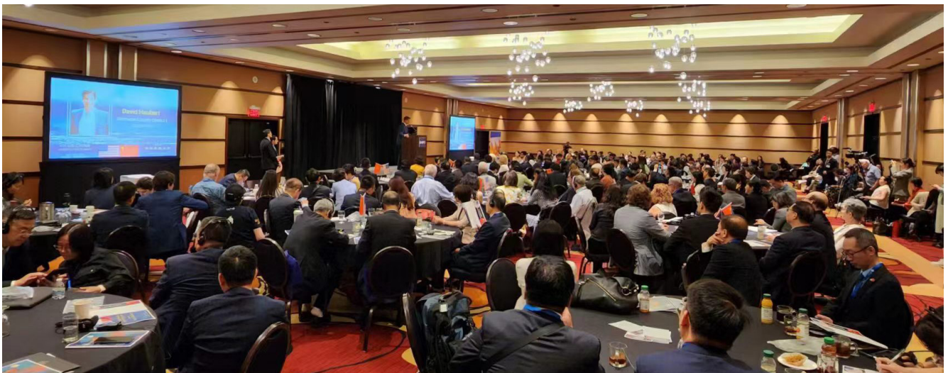
The Sixth US-China Sister Cities Summit is successfully held in the US.

The US-China Sister Cities Summit was co-founded by the CPAFFC and the SCI in 2014. It has been held for six sessions so far and is one of the important mechanisms for local exchanges between China and the US. This is the first time the summit has been held in the US since the start of the COVID-19 pandemic. ■