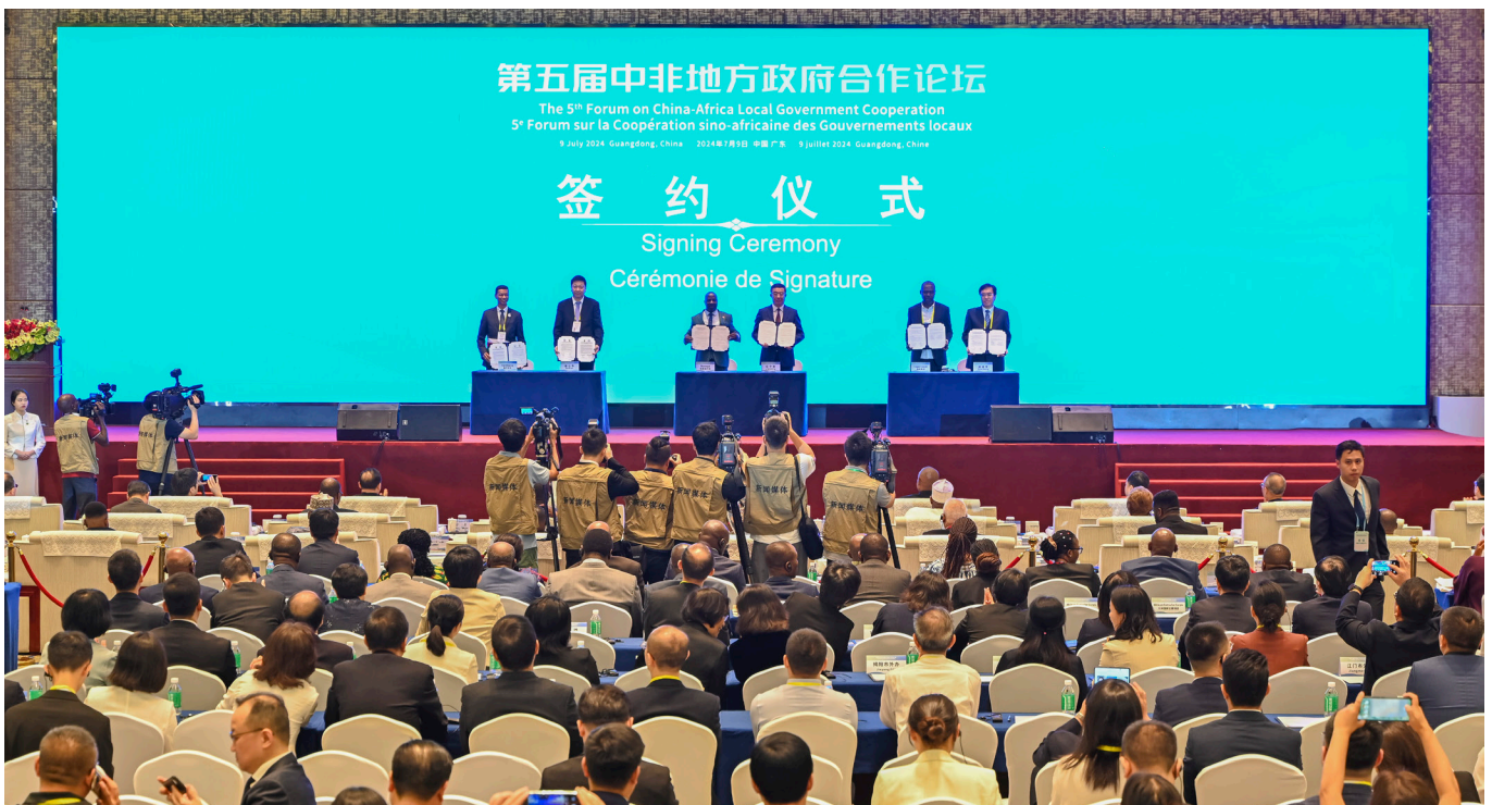
The Fifth Forum on China-Africa Local Government Cooperation is successfully held in Guangzhou.

The Forum on China-Africa Local Government Cooperation is an important institutional activity under the framework of the Forum on China-Africa Cooperation. It is a triennial activity first launched by the CPAFFC in 2012. ■