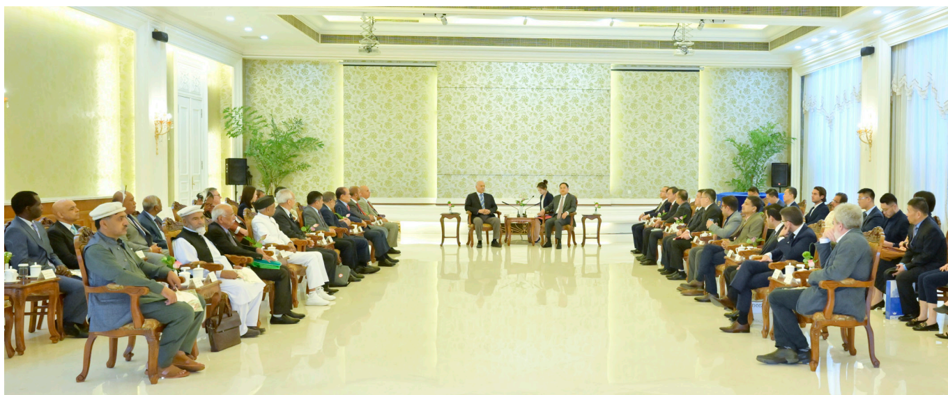
CPAFFC President Yang Wanming meets international friends attending the commemorative event for the 70th anniversary of the Five Principles of Peaceful Coexistence in Beijing.

The foreign guests at the banquet thanked the CPAFFC for its warm invitation and reception on the important occasion of the 70th anniversary of the proposal of the Five Principles of Peaceful Coexistence. They spoke highly of the historical and contemporary significance and value of the five principles and praised China’s achievements under the leadership of the Communist Party of China, and its important contribution to global and regional security, stability, development, and prosperity. They expressed firm support for the one-China principle and willingness to work with China to carry forward the Five Principles of Peaceful Coexistence and contribute to the building of a community with a shared future for mankind. ■