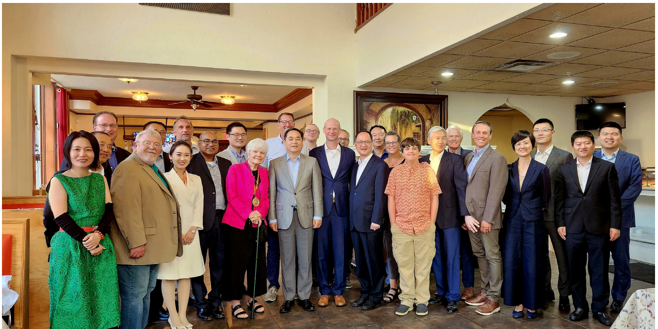
Chinese visitors and American friends pose for a group photo.

peoples cultivated by President Xi. He said that the visit to Muscatine has fulfilled his long-time expectation, experiencing in person the special friendliness of people from all walks of life in Muscatine for President Xi and the Chinese people. He also noted that there exists broad space of cooperation despite difficulties in bilateral relations. The two peoples have great passion for mutual learning and deeper mutual understanding. The CPAFFC stands ready to further advance the friendship between China and Iowa, and will promote its continuation from generation to generation by expanding youth exchanges between the two