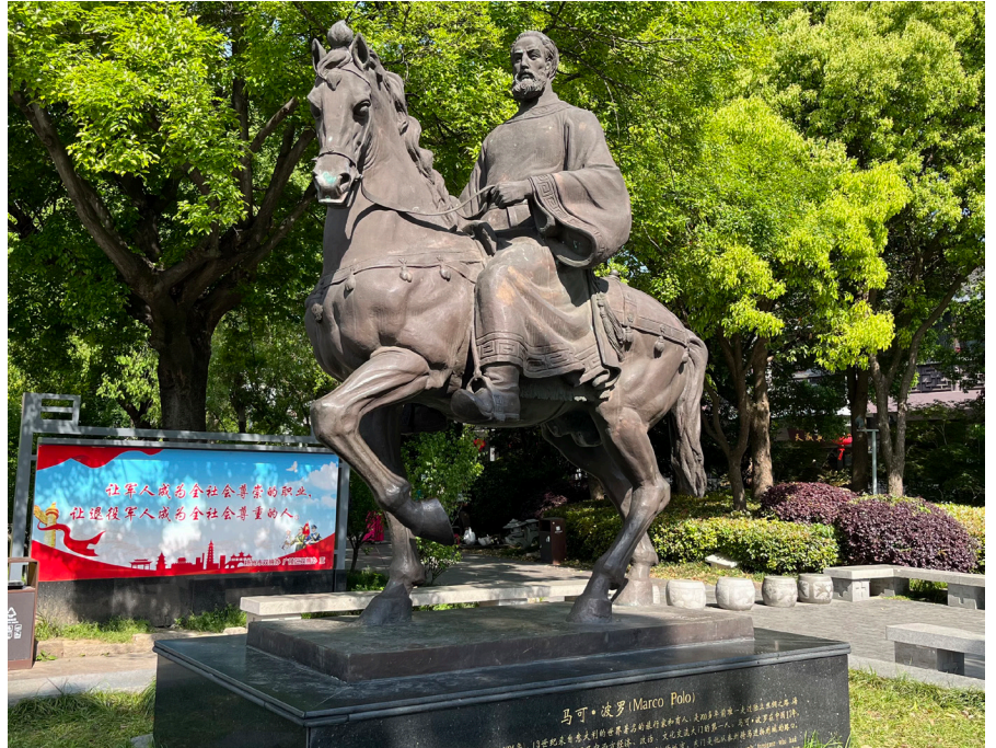
A statue of Marco Polo riding on a horse and about to enter the city, in the East Gate Square of Yangzhou.

In 2015, the 2,500th anniversary of the founding of Yangzhou city, an international seminar on Marco Polo was held to support the bidding for the Maritime Silk Road as a UNESCO cultural heritage. Experts and scholars from various countries discussed and reached a consensus on the statement that Marco Polo governed Yangzhou under the command of the Great Khan. They agreed that the reason Kublai Khan chose such a foreigner as governor of Yangzhou was because