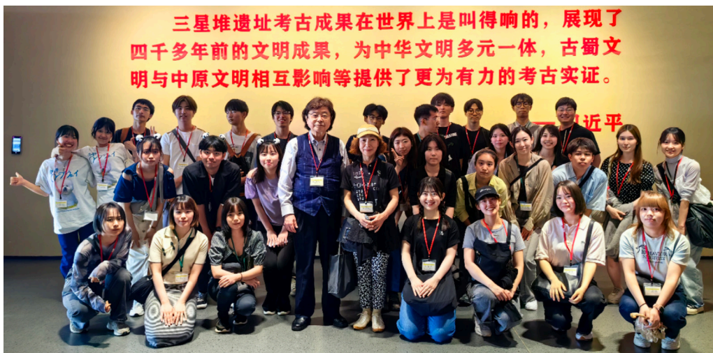
The delegation visits the Sanxingdui Museum.

At the Chengdu Research Base of Giant Panda Breeding, the delegates couldn't contain their excitement