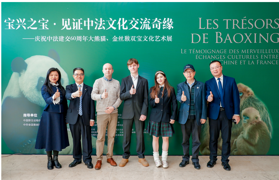
Chinese and French guests take a group photo at the opening ceremony of the exhibition.

The exhibition told stories of the deep friendship between the Chinese and the French people with the help of giant pandas. The exhibition featured a collection of precious photos, including China's first gift of giant pandas to France in 1973, the journey of Huan Huan and Yuan Zai from Chengdu to Beauval Zoo of France in 2012, and the naming of the giant panda Yuan Meng, born in France, by the first ladies of China and France in 2017. There were also photos of Armand David's descendants visiting Baoxing county to trace their