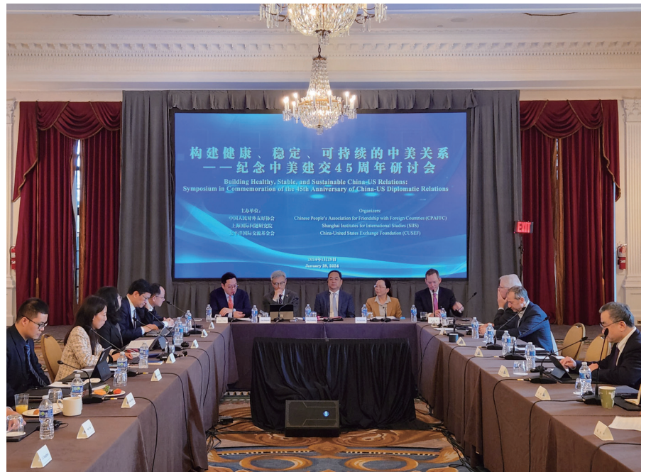
CPAFFC President Yang Wanming attends a seminar in commemoration of the 45th anniversary of the establishment of China-US diplomatic relations.