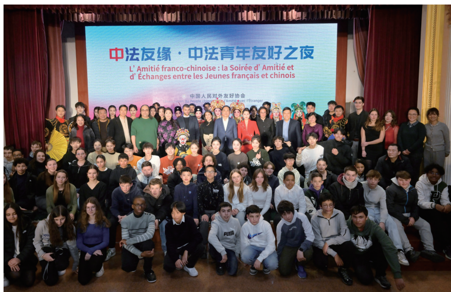
Sino-French Friendship: The Night of Friendship and Exchanges Between Chinese and French Youth held in Beijing.

Yang expressed the following three expectations of the youth in China and France. First, they should firmly safeguard the bilateral friendship through seeking common ground while shelving differences. Guided by the common characteristics and values of the two peoples, they should display the time-honored cultures of the two countries through exchanges; tap the wisdom of the youth of the two countries in keeping up with the times; cultivate friendship through mutual learning; and continuously explore new sources of bilateral friendship in the next six decades. Second, they should actively carry forward the “China-France spirit” with concrete actions. They should carry forward traditions, make sincere communication, expand consensus, and take actions to achieve more, so that they will present to the world a positive image and inject fresh meanings into the “China-France spirit” in the new era. Third, they should carry forward the common values and contribute to the building