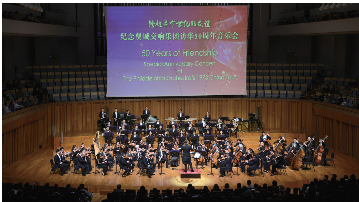
The Philadelphia Orchestra performs at the National Center for the Performing Arts in Beijing.

Half a century has flown by like a fleeting flash. The story between the Philadelphia Orchestra and China is composed of strings of notes, contributing to the beautiful music of friendship between China and the US. Flowing notes linger in people’s hearts, and the Eastern and Western civilizations blend here across time and space. The Chinese and foreign singers stand shoulder to shoulder, reciting lines of verse on friendship: “To have in this world a good friend like you, / Is like having someone always by my side.” ■