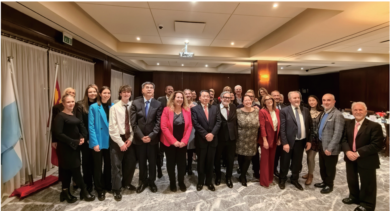
Chinese visitors and foreign friends pose for a group photo.

The delegation also met with Andrea Belluzzi, Minister of Education and Culture of San Marino, and Dario Galassi, non-resident ambassador of San Marino to China, visited the Confucius Institute of San Marino, and presented exhibits to the San Marino Museum of Chinese Art. ■