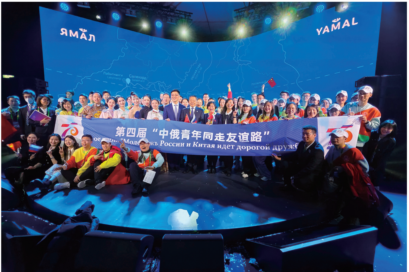
Fourth China-Russia Youth Friendship Road successfully held in Sochi.

The China-Russia Youth Friendship Road was initiated by the CPAFFC in 2019, aiming to implement the important consensus reached between the two heads of state on strengthening friendly exchanges among the youth of both countries. The previous three sessions were successfully held in China. ■