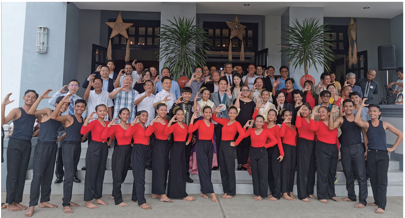
President Yang Wanming takes a photo with friends from all walks of life in the Philippines.