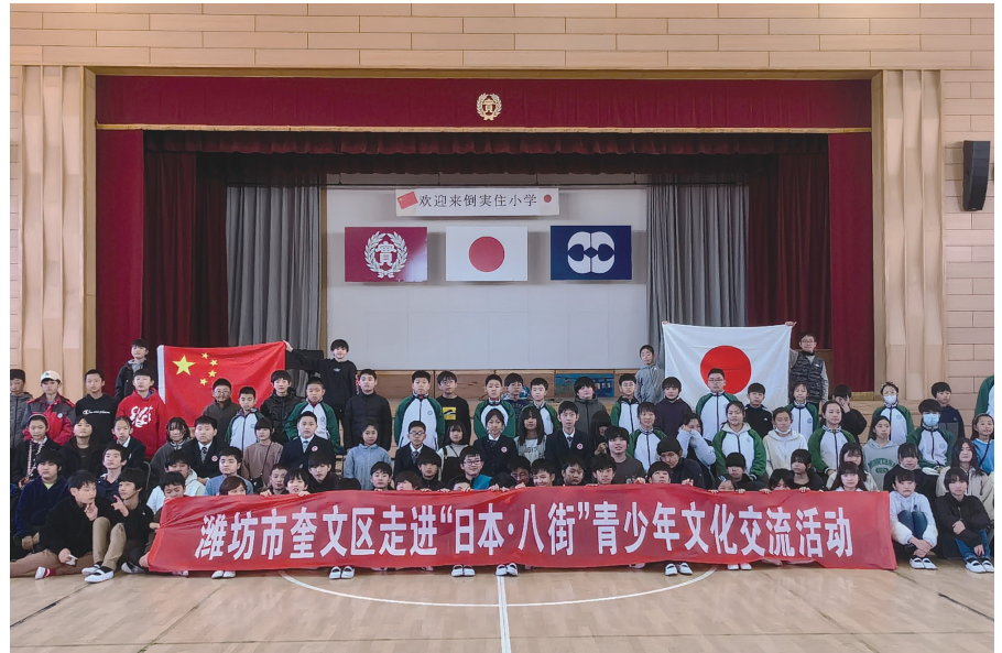
Educators and students from Kuiwen District, Weifang, visit Japan on a cultural exchange.