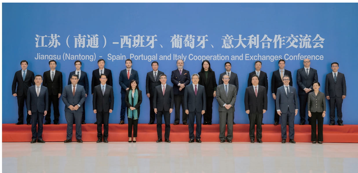
Jiangsu(Nantong)-Spain, Portugal and Italy Cooperation and Exchange Conference held successfully.

Culture can connect hearts, and art can string the world together. During the event, guests at home and abroad were able to further understand Jiangsu and feel Nantong through immersive activities — including intangible cultural heritage interactions,