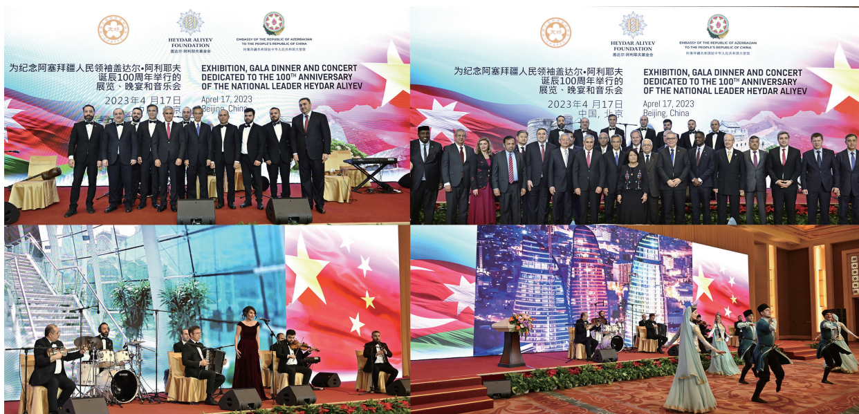
Celebration of 100th birthday of Heydar Aliyev, national leader of Azerbaijan, held in Beijing.

The event went on in a friendly and warm atmosphere, praised by all participants as a complete success. ■