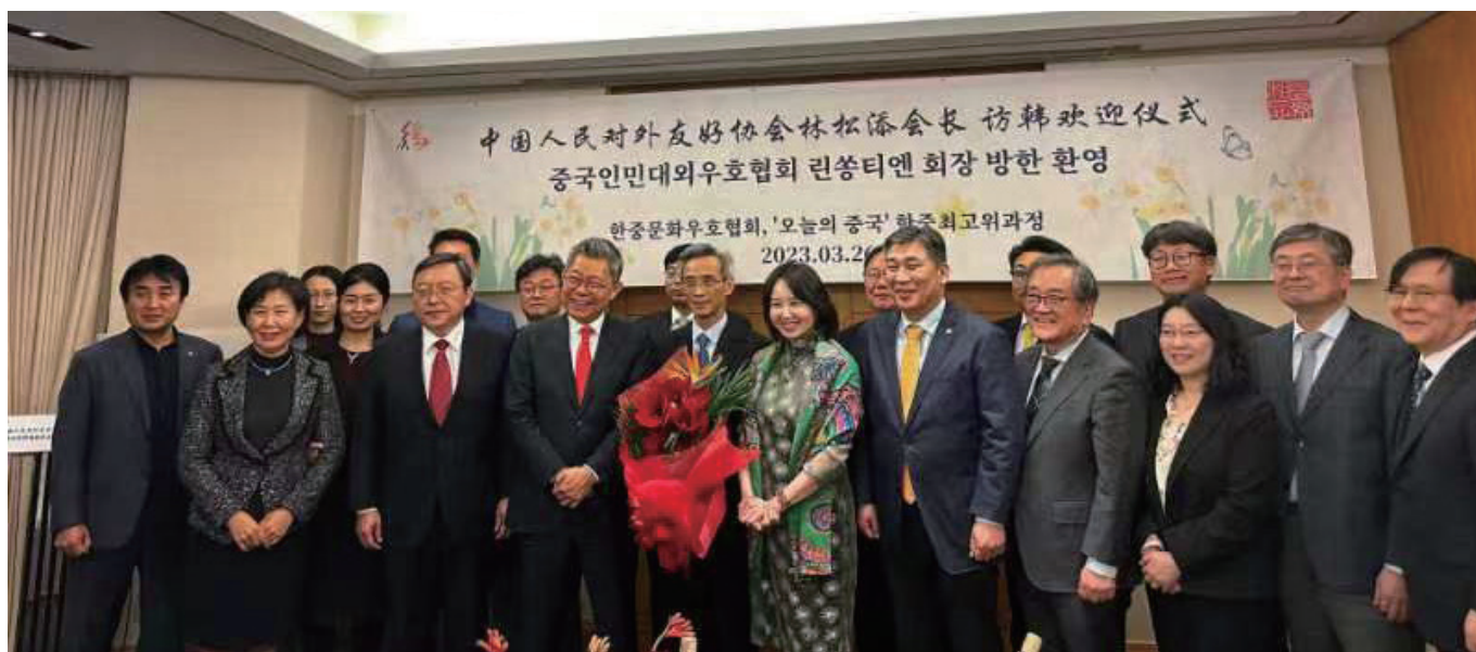
President Lin (5th left) takes a photo with Korean friends of various social circles.

Both sides expressed their expectations for an early and comprehensive resumption of face-to-face exchanges and cooperation between the two countries and sustained and in-depth development of bilateral friendly and mutually beneficial cooperative relations. The ROK side said that bilateral relations involve not only communities of common interest and shared future but also shared civilization, heart and science and technology. ■