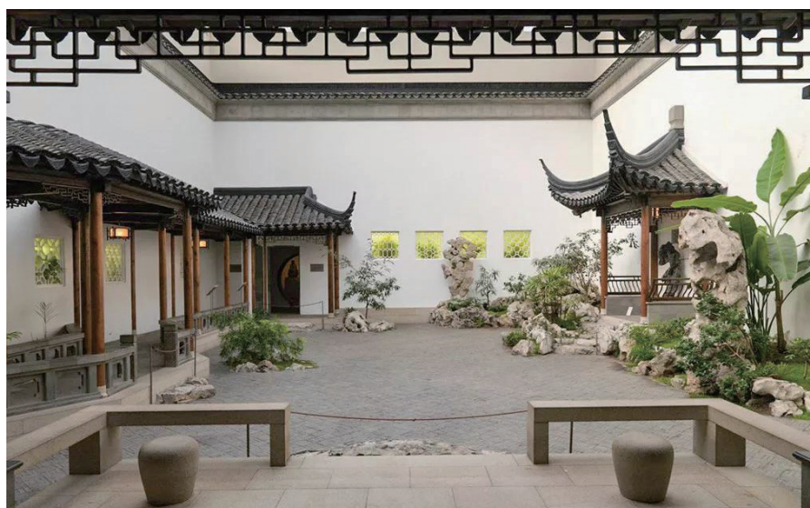
The Astor Court.

Entering the main hall, visitors can see a plaque of two Chinese characters “Ming Xuan”, literally “Ming Study”. The study housed a collection of Ming dynasty calligrapher and painter Wen Zhengming’s art works. The hall was furnished in simple and elegant Ming style. Desks