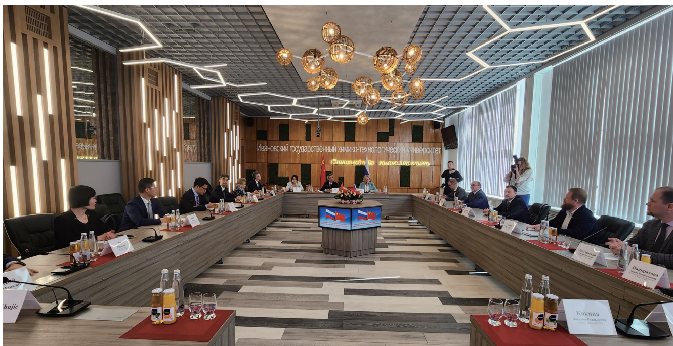
A seminar on President Xi Jinping's state visit to Russia and China-Russia relations was held successfully.