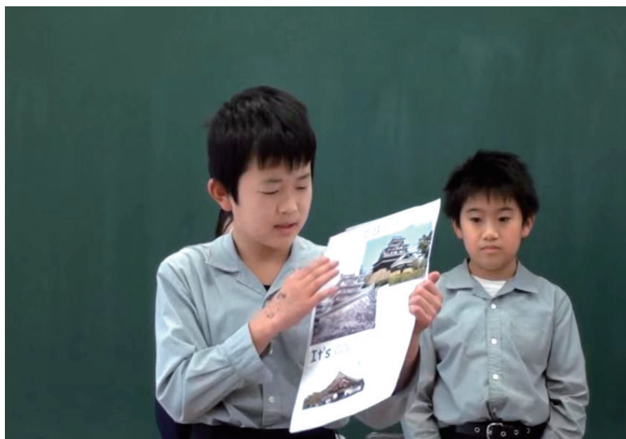
Students of the CSFESU introduce the former site of Songjiang city.

Though the unexpected COVID-19 pandemic in 2020 put the visit of 21PS to Shimane on hold, the stu-