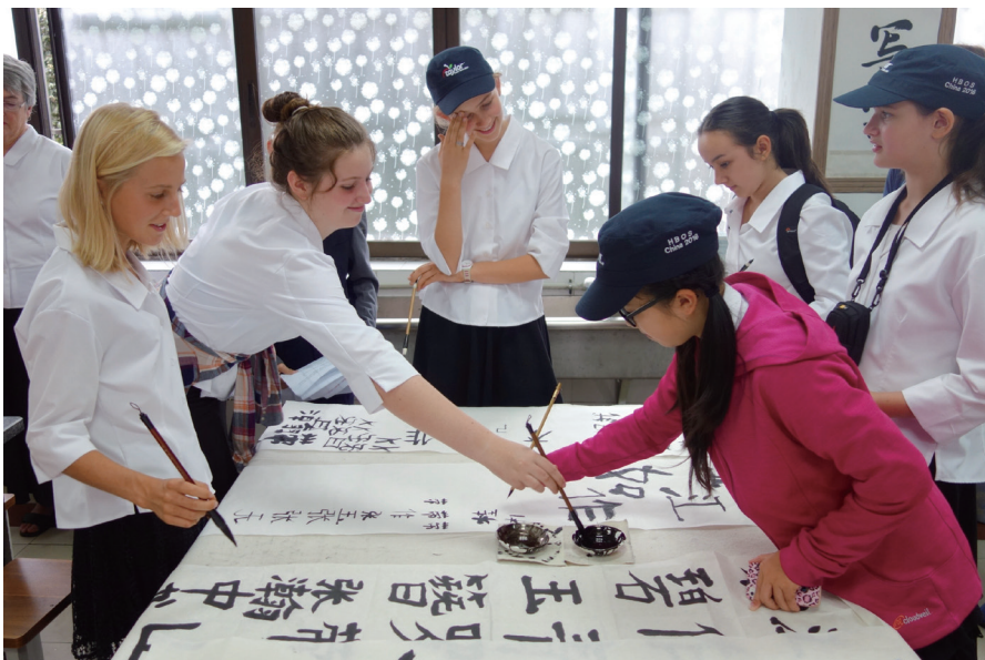
High School students of Hastings experienced Chinese calligraphy at Ronghu Primary School in Guilin in 2016.