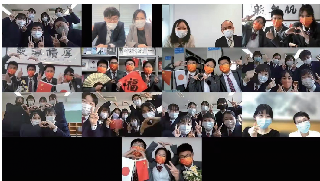
Chinese and Japanese students interact online.

In the early stage of the activity, to ensure that it would come off smoothly, leaders of the Foreign Affairs Office of Zhangzhou led teams to Zhangzhou No 1 Foreign Language School several times to guide the preparatory work. Through close cooperation and attentive organization, Zhangzhou displayed the vigor and vitality of the high school students and built a bridge of people-to-people bonds. ■