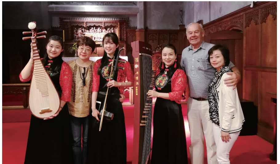
In 2018, Guilin Folk Music Group went to Hastings for exchange performance.

Thanks to the leadership and promotion by the leaders of the two cities, the friendship city relationship has come a long way since the 1980s, with confidence and determination and steps firm and steady.