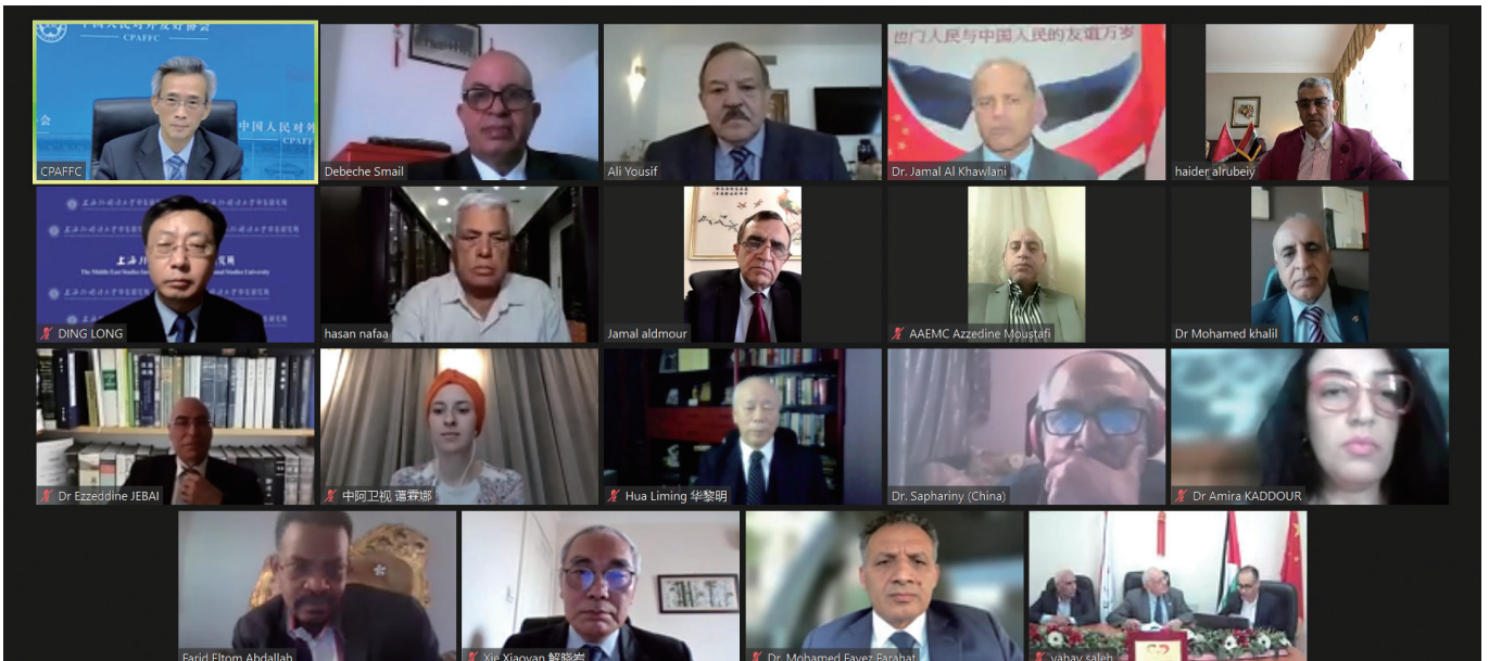
Friendship bodies of China and Arab countries held a dialogue online successfully.

We agree that the theme of the times, peace and development, faces severe challenges. The world is neither safe nor peaceful. It is the common aspiration of people of all countries to promote peace, development and cooperation and jointly build a community with a shared future for mankind. The