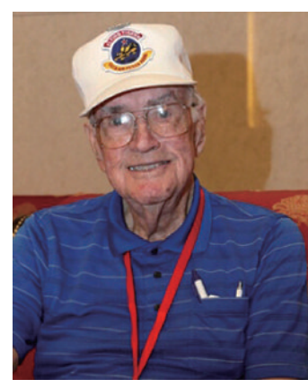
USAAF Troop Carrier Command, C-47 & C-46 Hump Airlift pilot

I still keep many of the articles I used in China, such as maps, money, etc., because they are memorial for the war and are invaluable in my heart. There was a translation book called "Pointie Talkie" which was intended for use in the event of being downed over China. To communicate with any native Chinese encountered, the pilots would find a phrase in English and point to the Chinese language translation. For example the pilots could ask a question such as "please show me on any map you may have where I am."