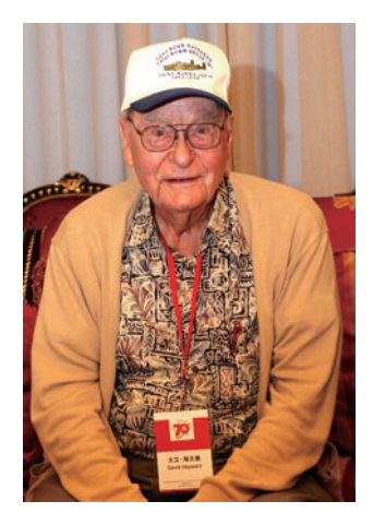
14th Air Force B-25 bomber pilot, 22nd Medium Bomb Squadron, 341st Bomb Squadron Group

Until now, my very first mission is still fresh in my mind. At that time, our crews were broken up, so we could gain experience flying with more experienced people. So, on that very first mission, I was flying as a co-pilot for a very experienced pilot, and our mission was to go to an airfield to try and destroy the air strip the enemy was using.