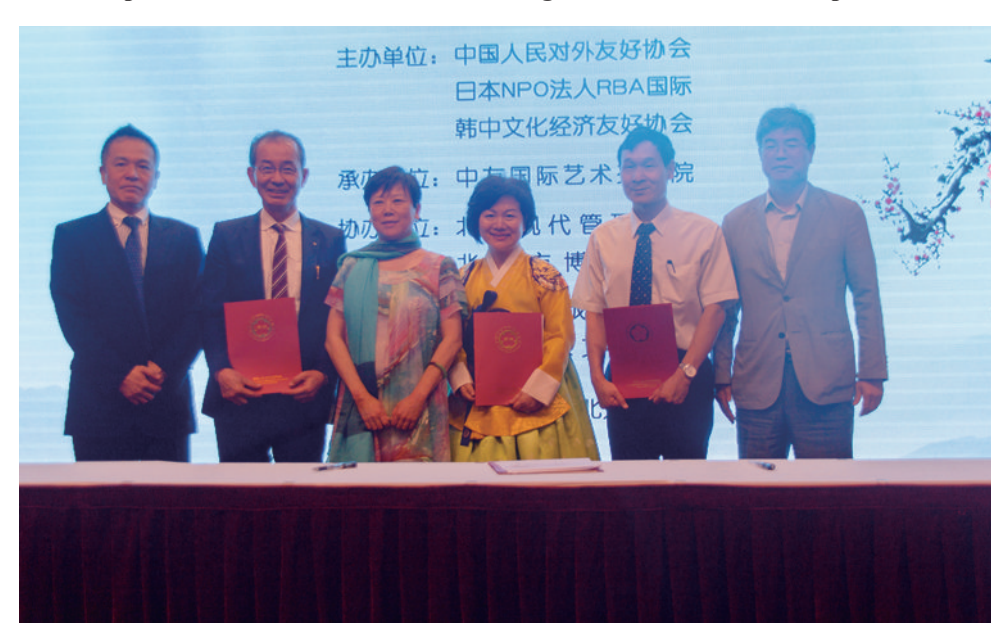
CPAFFC, Japan NPO, RBA International and the Korea-China Association for Friendship in Cultural and Economic Fields sign a memorandum of cooperation

Flower arrangement has been practiced in China for thousands of years. As one of the important classical arts of the nation, it has developed a unique art system through integration with calligraphy, painting, gardening and ceramics. Chinese flower arrangement started in the Southern and Northern Dynasties and experienced ups and downs to reach a golden era in the Sui, Tang and Five Dynasties, an era in which the literati admired elegance and ladies loved flowers. At that time, Bud-