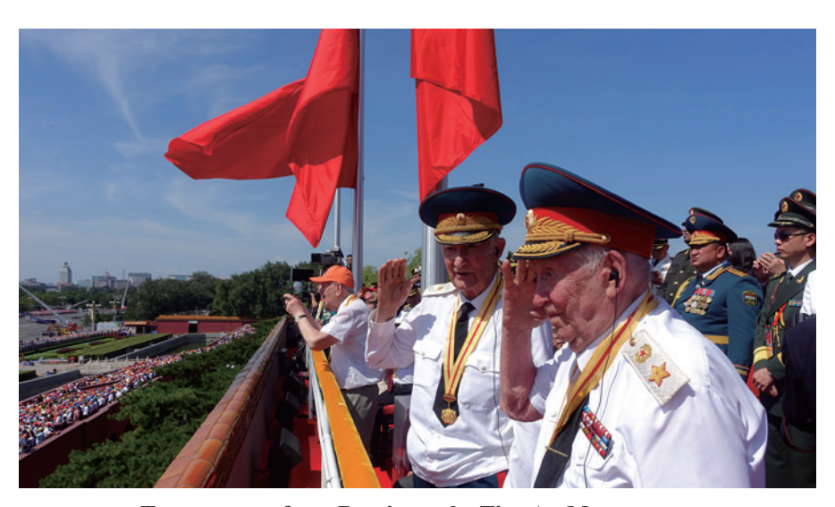
Two veterans from Russia on the Tien An Men rostrum

General Shudlo, 88, participated in all the activities in Beijing marking the 70<sup>th</sup> anniversary of the victory of the Chinese War of Resistance against Japanese Aggression and world victory against fascism.