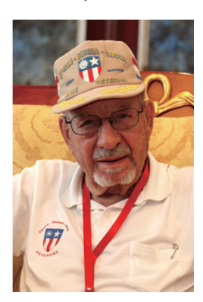
Ground support staff, 4th Combat Cargo Squadron, 1st Combat Cargo Group