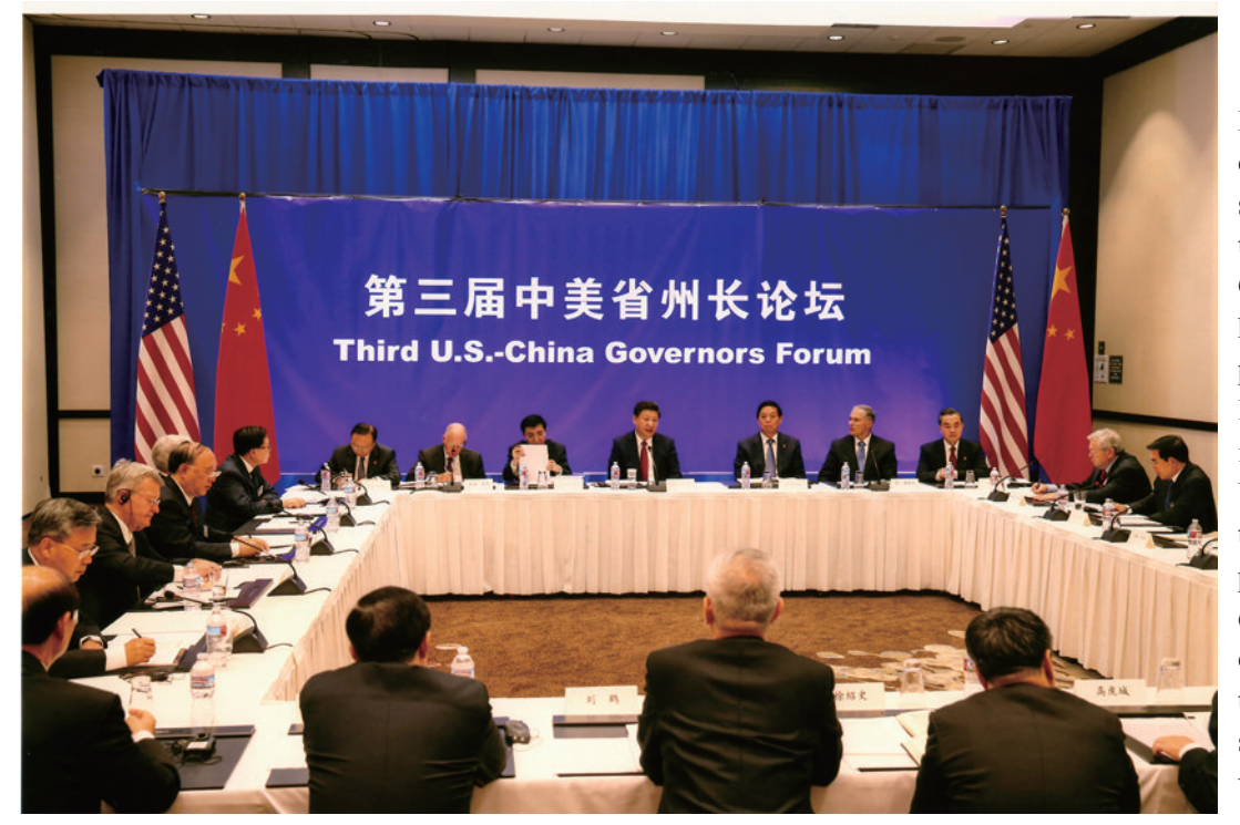
President Xi Jinping addresses the Third China-US Governors Forum

During the forum, the two sides signed The US-China Governors' Accord on Clean Energy and Economic Development and held six one-to-one meetings.