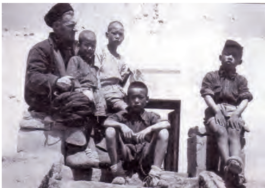
Rewi Alley with orphans in Shandan