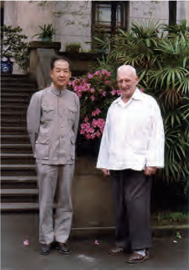
In May 1980, Rewi Alley and the author in Chongqing

People's War of Resistance Against Japanese Aggression in 1937, a large number of unemployed workers in Shanghai escaped to the rear area. In order to help find jobs for these people, Rewi Alley and Edgar Snow jointly launched the Chinese Industrial Cooperative ("Gung Ho") Movement to set up cooperatives and organize the unemployed workers and poor peasants into production. The Gung Ho, as explained by Rewi Alley, meant "get united and work together".