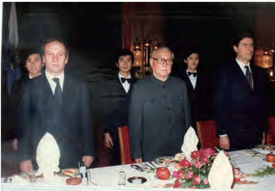
In 1988, Chinese President Li Xiannian hosting a banquet in honor of the visiting Head of State of San Marino Gian Franco Terenzi

present at the function. I did not hesitate to contribute my bit and personally promoted the issuing of commemorative stamps for the occasion by the Autonomous State Agency for Philately and Numismatics.