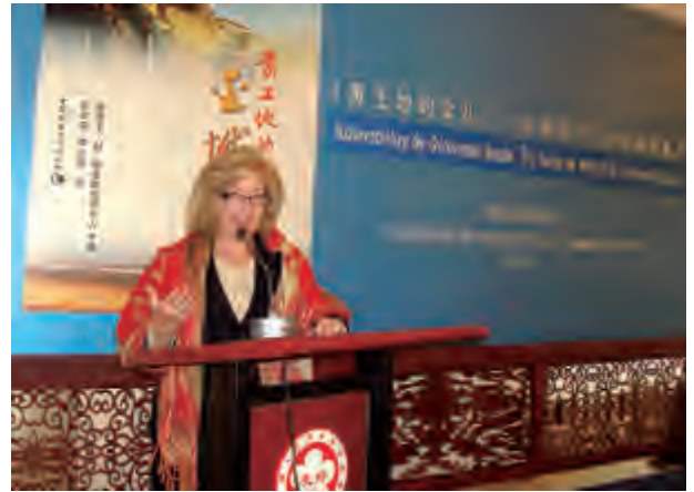
The author speaking at the launching ceremony of the Chinese version of her book Princess Jincheng

Though in Germany every municipal and state government has the department for external communication, most of the friendship-with-China organizations are operated in the form of associations established by private individuals. However, both the German people-to-people friendship organizations and the CPAFFC are rich in experience and proficient in the principles