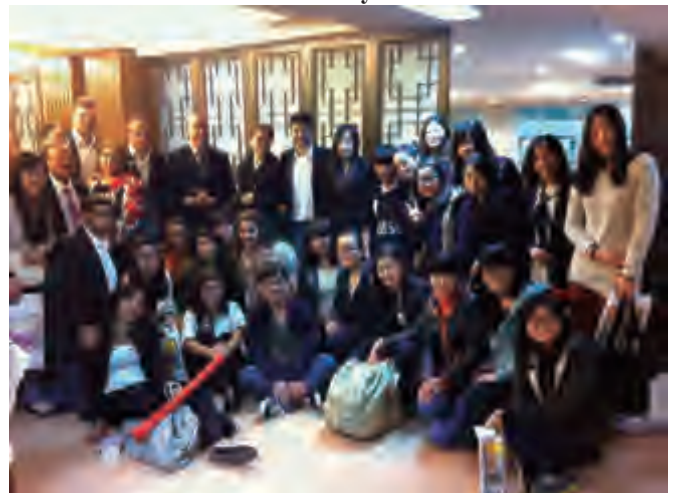
The LCLFC delegation with the students of the Beijing International Studies University