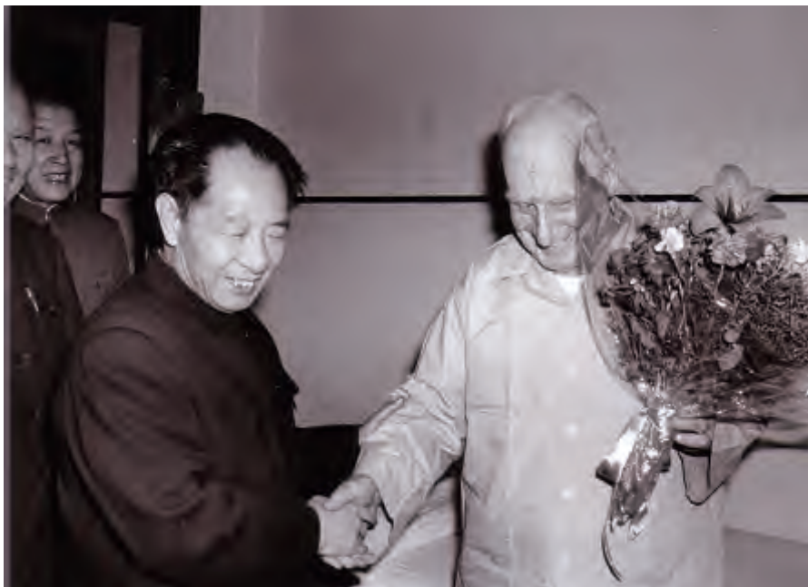
Comrade Hu Yaobang visiting Rewi Alley in Peking Union Medical College Hospital in March 1982

steadfast and focused his energy on establishing the Bailie School training cadres for the Gung Ho movement.