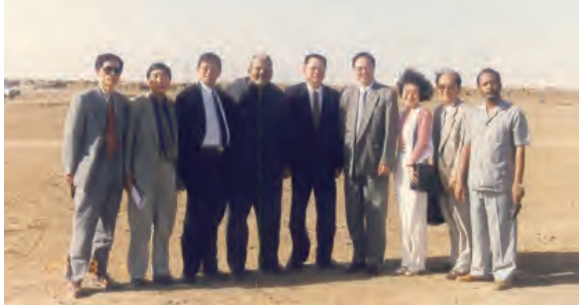
With leaders of the Shanghai Pharmaceutical Co., Ltd. and Sudanese cooperation partners at the site of would-be pharmaceutical plant in 1998

In 1998, he was assigned by the Shanghai Pharmaceutical Co., Ltd. to set up the company's first overseas manufacturing base in Sudan. Over the past decade or so, the Shanghai-Sudan Pharmaceutical Co., Ltd. (SSPC) has met challenges, overcome difficulties and kept developing. It has been designated by the Sudanese Ministry of Health as a benchmark pharmaceutical enterprise. The SSPC is Sudan's first local pharmaceutical enterprise producing anti-malaria medical products and the first pharmaceutical manufacturer that has passed Sudan's National GMP Certification. With its first-class purification facilities and strict GMP management process, it has become a model up-to-