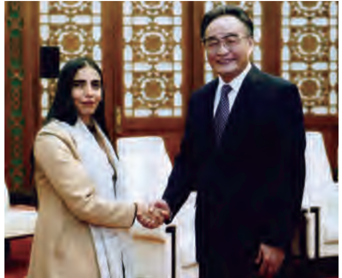
NPC Standing Committee Chairman Wu Bangguo with Bolivian Senate President Gabriela Montano

Montano said that, despite the geographical distance between them, Bolivia always paid close attention to China's development and progress and