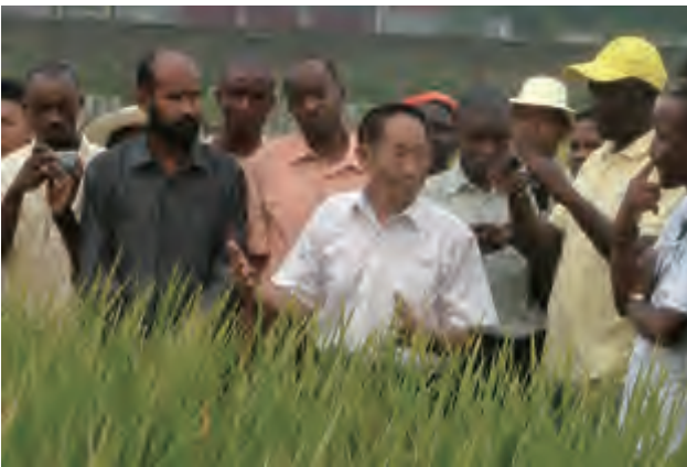
Yuan Longping and his students

Yuan Longping is regarded as the first scientist to successfully make good use of heterosis. He started his research on hybrid rice in 1964. In recent years, the annual planting areas of hybrid rice in China have accounted for 57 percent of the country's total rice areas, with an annual yield increase of 2.50 million tons, which is enough to feed 70 million people. In 2011, a major breakthrough was made in the research of the super hybrid rice. With a target yield of 900 kilograms per mu , he was able to harvest a yield of 926.6 kilograms per mu in the large trial field. Reputed as the "father of hybrid