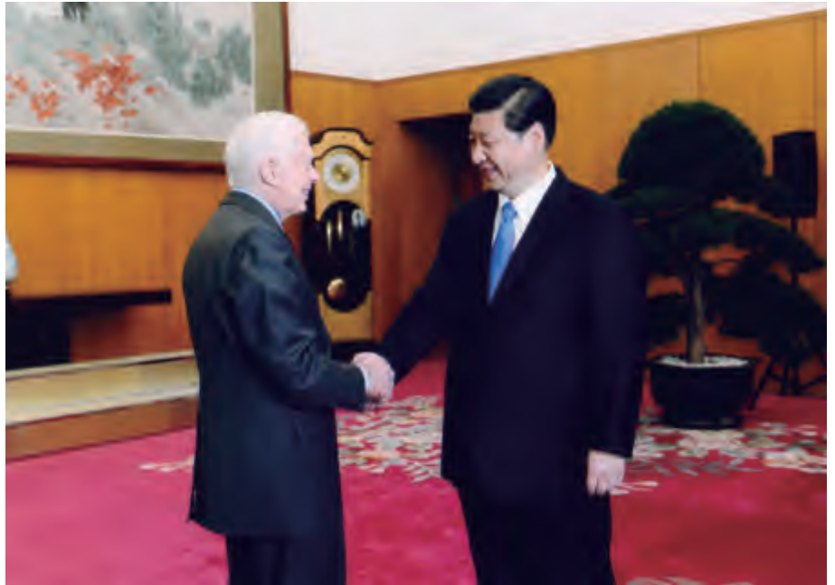
Xi Jinping, General Secretary of the CPC Central Committee, meeting with former US President Jimmy Carter

Of all the scheduled activities, the ones attracting most attention were his meetings with General Secretary Xi Jinping and Vice Premier Li Keqiang. It was the first official meetings with American guests for the new generation of Chinese leaders since the 18th CPC National Congress and the US presidential election. They spoke highly of the historic decision made by the older generation of Chinese leaders and President Carter to establish diplomatic relations, and stressed that, in the new situation, China and the U.S. should defy difficulties, be innovative and accumulate “positive energy” in their