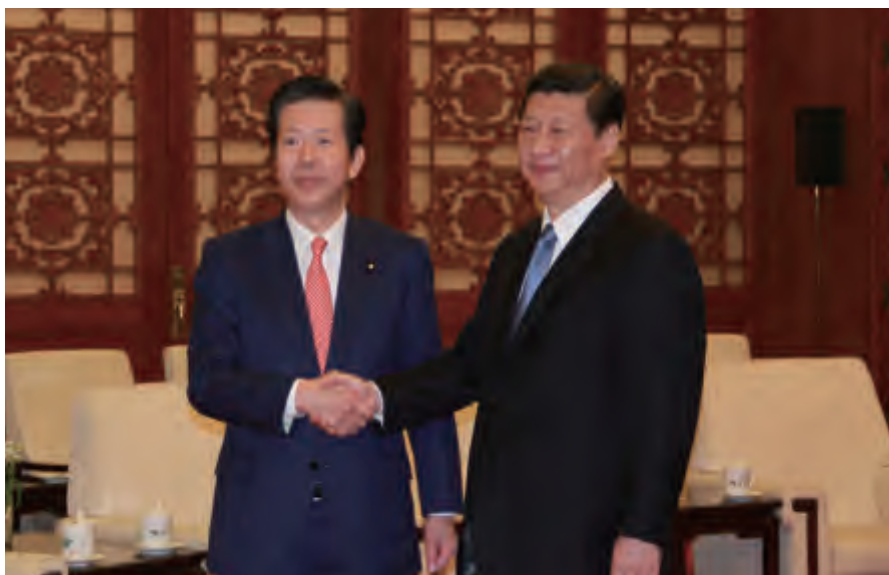
General Secretary Xi Jinping meeting with Natsuo Yamaguchi

development of relations, we must look at the larger picture, steer our affairs in the right direction, and promptly and properly handle sensitive issues... Facts have proven that the four political documents between the two countries constitute the cornerstone of China-Japan relations and should be earnestly observed. Under the new circumstances, we should shoulder national and historical responsibilities and display political wisdom like the older generation of leaders, overcome difficulties in China-Japan relationship and push it forward."