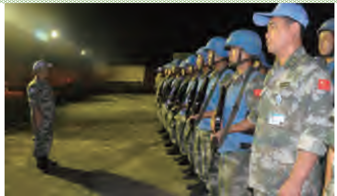
Col. Li Genchang making a mobilization speech before a long-distance transport mission

Making full use of their advantages, the Chinese peacekeeping contingents under his leadership provided technical, material and intellectual support for Liberia's post-war reconstruction. They completed the repair of 35 bridges, extension and upgrading of over 1,000 kilometers of roads, transported materials of over 50,000 tons covering a mileage of more than 480,000 kilometers, and provided medical treatment to 2,720 person/times. Moreover, they offered humanitarian assistance to local people with difficulties, providing them