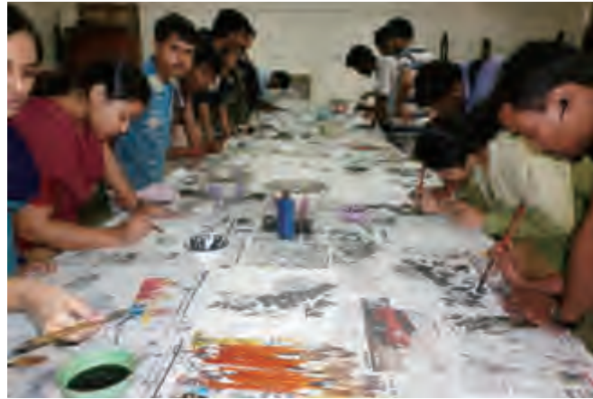
Learning to paint Chinese style