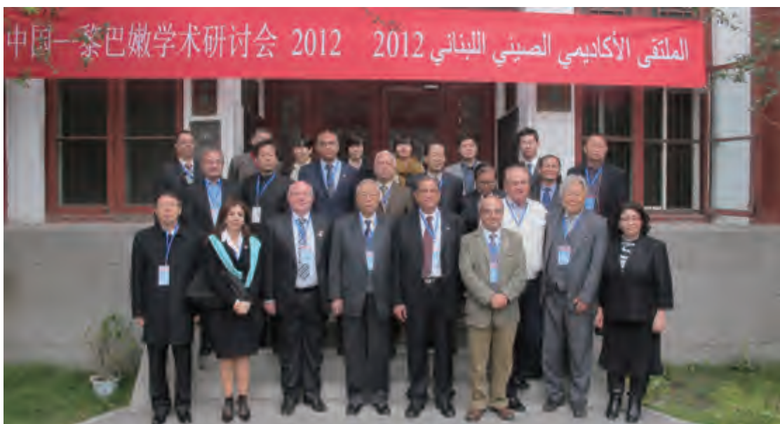
The participants of the Symposium posing for a group photo