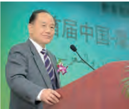
Wu Sike making a key-note speech at the Symposium on China-Morocco Cultural and Educational Exchange

Wu Sike, born in 1946, is a senior Chinese diplomat. He served as director general of the Department of West Asian and North African Affairs of the Ministry of Foreign Affairs (1996-