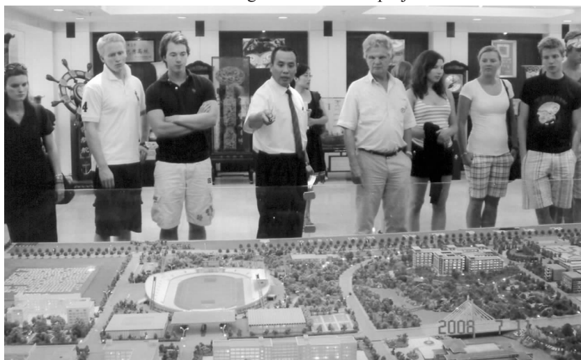
The Norwegian students visiting Taishan Medical College

itage—the Temple of Golden Pavilion, the Tokyo Disneyland, Kyocera Headquarters and the Kyocera Kokubu Plant in Kagoshima. The students were invited to stay with the families of Kyocera staffers where they spent two pleasant and unforgettable days with their Japanese “mums” and “dads”, “brothers” and “sisters”. During the visit, the Chinese children gained a lot of fresh knowledge, broadened their vision, increased their understanding of China's neighbour Japan and forged deep friendship