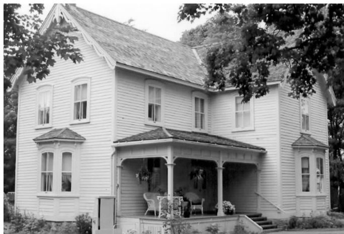
The birth place of Dr. Norman Bethune

At 2 o'clock that afternoon, the group attended the opening ceremony of In Memory of Norman Bethune—an exhibition of gifts from China. In his speech at the ceremony, the head of the working group highlighted the important contributions made by Dr. Bethune to the Chinese revolution and the Chinese people's deep love and respect of him over the years, and briefed about