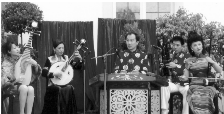
Chinese Traditional Instruments Group giving a performance