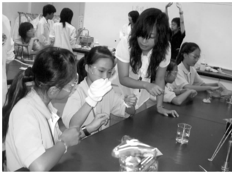
Chinese children at the Ritsumeikan Junior & Senior High School in Japan

A 48-member Chinese children's friendly exchange delegation, organized and sent by the China-Japan Friendship Association (CJFA), paid a goodwill visit to Japan from July 13 to 21 at the invitation of Kyocera Corporation of Japan. It was the eleventh delegation under the friendship-with-China exchange programme launched at the initiation and care of Mr. Kazuo Inamori, founder of Kyocera. Up