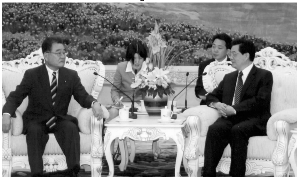
President Hu Jintao meeting with JCFA President Koichi Kato