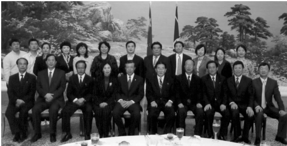
Choe Chang Sik, chairman of the DPRKCFA Central Committee hosting a banquet in honour of the delegation

cluding the Korean Central TV (KCTV), and the Korean Central News Agency (KCNA) gave full coverage of the delegation's visit, and attracted wide attention in the DPRK. Wherever the delegation went, they were accorded warm reception by the Korean people and an ebullient friendly atmosphere permeated.