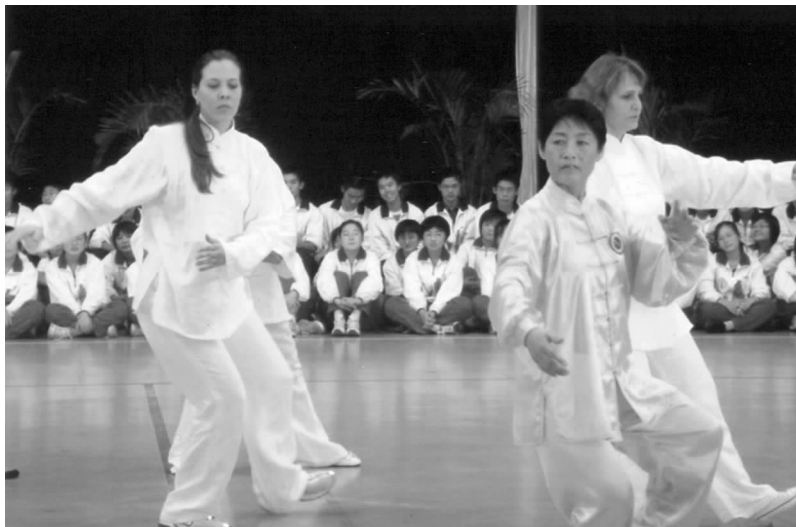
The contestants at the competition