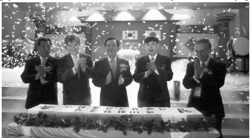
The opening ceremony of the China-Japan-Korea Friendship Cities Conference