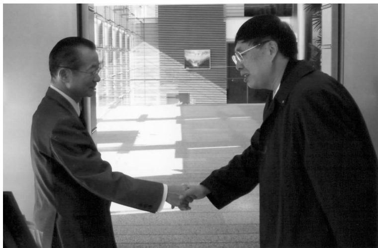
Takeo Kawamura (left), Japanese chief cabinet secretary, shaking hands warmly with CPAFFC President Chen Haosu (right)

On the evening of November 18, 2008, to celebrate the 30th anniversary of the signing of the China-Japan Treaty of Peace and Friendship, the Japan-China Cultural Exchange Association (JCCEA) held a lecture meeting entitled “Looking into the Future of