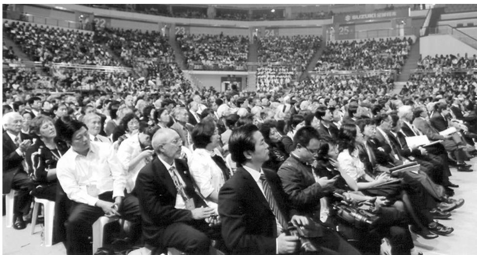
The meeting in session

province for the first time. The trip left on them deep impressions, enhanced their favourable opinions of Jiangsu and increased their confidence in co-operating with it. The fact that all the twinned counterparts of Jiangsu sent delegations to take part in the activities despite the long distance showed the importance they attached to developing friendly relations with the province. During the celebration, ceremonies to confer the title of Honorary Citizen of Jiangsu and Friendship Ambassador were held in recognition of the outstanding contributions