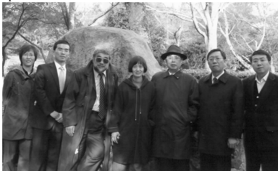
The delegation at Premier Zhou Enlai Poem Tablet at Arashiyama in Kyoto, Japan