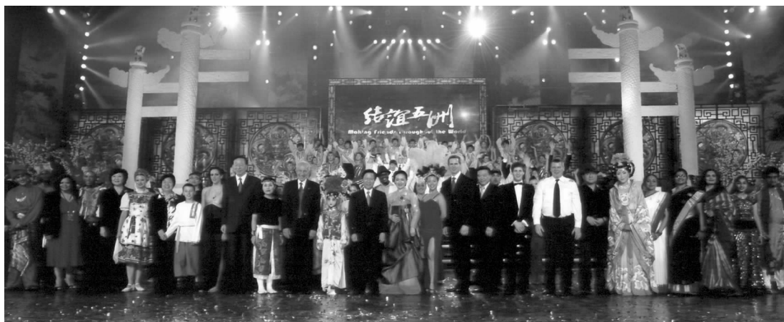
The art troupes from 13 countries giving a joint performance

the Republic of Korea, sent us messages of congratulations.