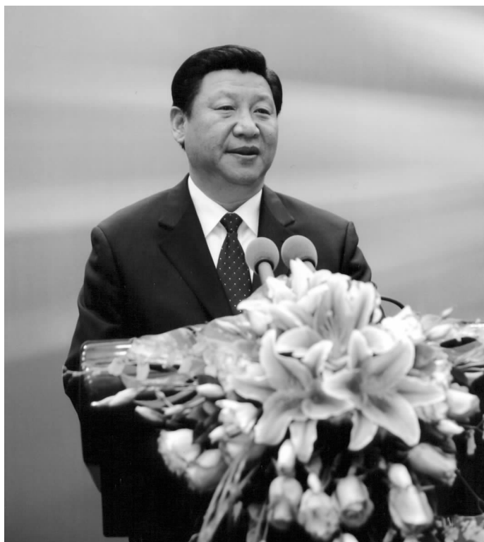
Chinese Vice President Xi Jinping speaking at the opening ceremony

This year marks the 30th anniversary of China's adoption of the policy of reform and opening to the outside world. In the past 30 years China has achieved the historic transition from a highly centralized planned economy to a vibrant socialist market economy and from a closed or semi-closed society to one that is fully open to the outside world. The 1.3 billion Chinese people on the whole lead a relatively comfortable life. This year, with the support and assistance by the people of other countries in the