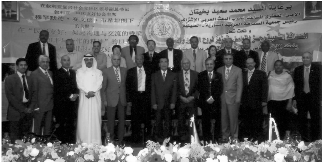
Some representatives to the conference at the opening ceremony

and Arab peoples and further popularize the spirit of peace, friendship and cooperation.