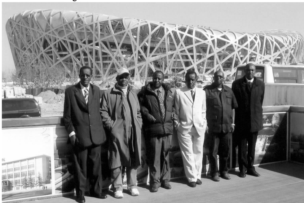
The delegation in front of the National Stadium under construction