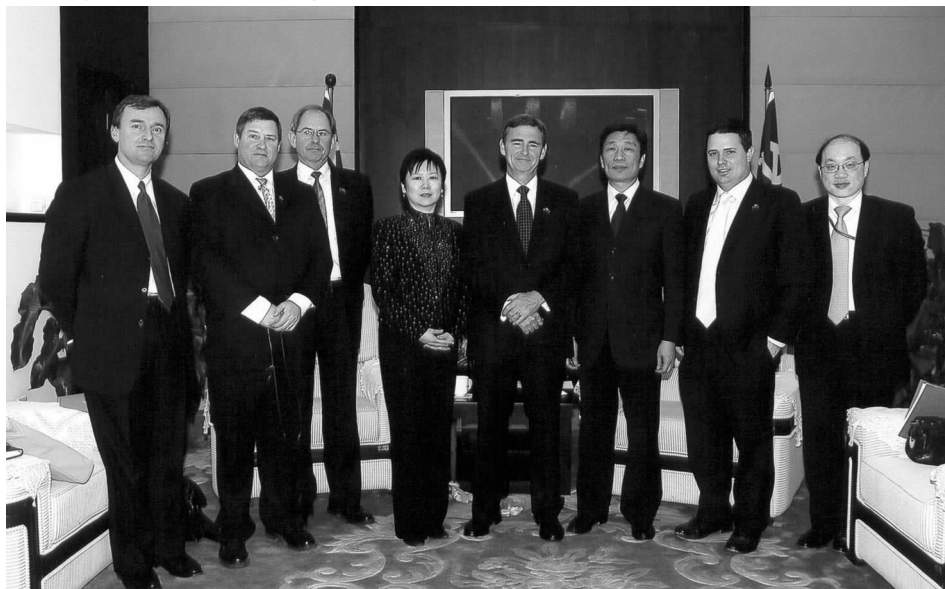
Li Yuanchao (L. 6), member of the Political Bureau of the CPC Central Committee, meeting with John Brumby, governor of Victoria, Australia

Li said, since Jiangsu Province and Victoria State twinned friendship-province/state relations in 1979, they have carried out extensive exchanges and cooperation in the economic, cultural, sports, educational and health fields. This time Governor Brumby would visit Jiangsu again, hoping to further promote friendly relations between the two localities. Li said, ten years ago I visited Victoria State and Melbourne, whose beautiful scenery left a good impression on me. I have a deep affection for my home place Jiangsu. Jiangsu and