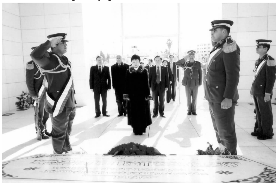
The delegation laying a wreath at the tomb of President Arafat

President Abbas extended welcome and thanks to Li Xiaolin for leading the delegation to visit Palestine under such circumstances, saying that this was the concrete embodiment of the Chinese people's support for the Palestinian people. He spoke highly of and expressed gratitude to the Chinese Government and people for their consistent support and selfless assistance to the Palestinian people's struggle for the restoration of their legitimate rights, and thanked the CPAFFC for organizing activities marking the International Day of Solidarity with the Palestinian People designated by the United Nations on November 29 every year for decades on end. President Abbas also happily spoke about his good feelings towards China and what