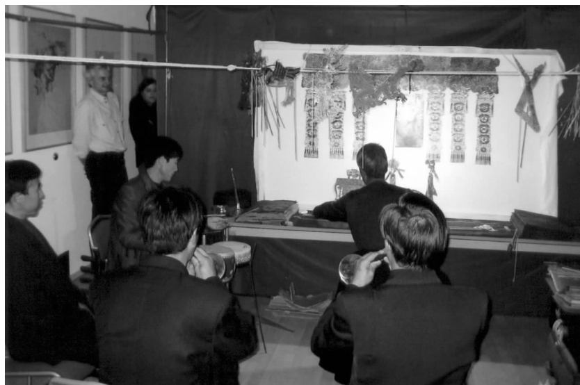
The China Folk Shadow Play Performing Group putting on a show

After finishing the performance in Vienna, that night the performers rushed to Mistelbach, a small city in Lower Austria 50 kilometres away from Vienna. Mistelbach is the centre of puppet and shadow show art in Austria and the whole Europe as well. Every October the International Puppet Theatre Festival is held in the city. Up till now the festival has been held for 29 years. The puppet and shadow play troupes from Beijing and Hunan have given performances there, giving the European audience an artistic treat. Different from the past, this time the shadow play troupe was an amateur one. Though its stage