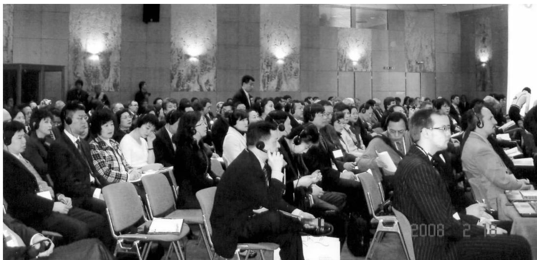
The conference in session

gional Development, presided over the conference.