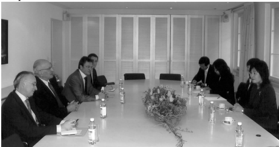
Pascal Couchepin, president of the Swiss Confederation, meeting with the Working Group

Both Zurich and Lausanne are very willing to carry out cultural exchanges with China. The City of