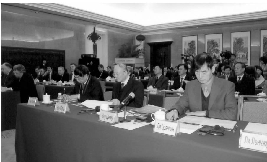
The Forum on China-Russia Trade and Economic Relations in session