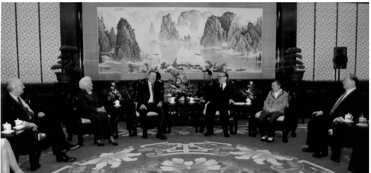
Jiang Zemin meeting with former US President Bush and his party