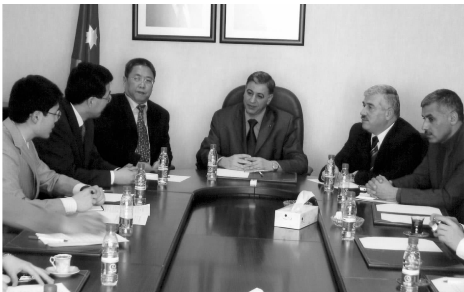
Shihadeh Abu Hudeib, minister of municipal affairs of Jordan, meeting with the delegation