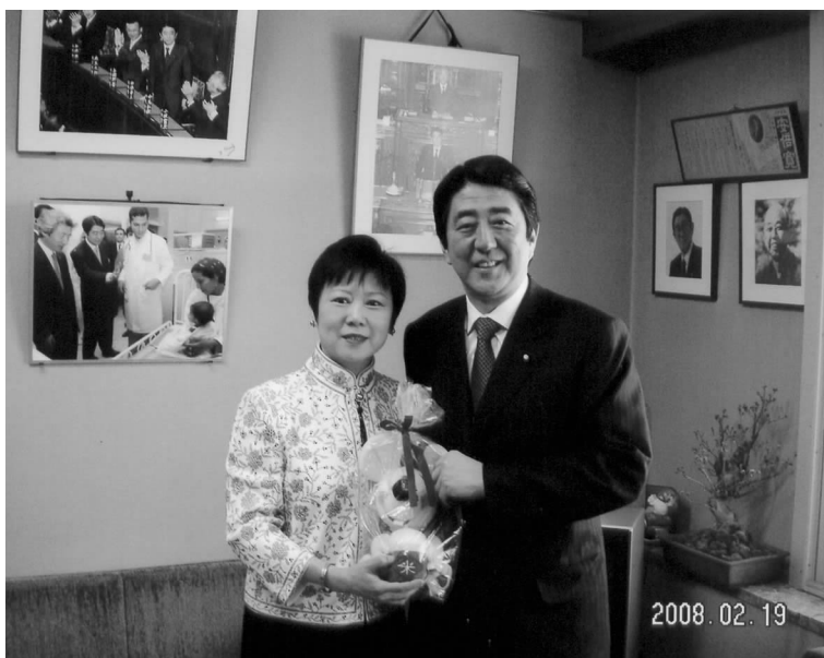
Former Japanese Prime Minister Shinzo Abe meeting with CPAFFC Vice President Li Xiaolin