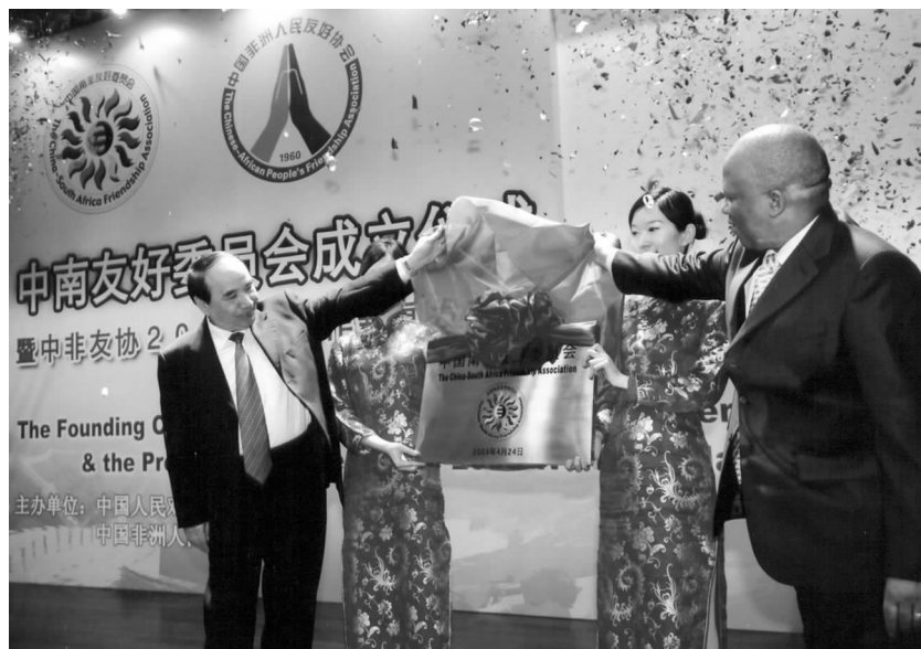
Abdul'ahat Abdurixit (L.), vice chairman of the CP-PCC National Committee, and Ndumiso N. Ntshinga, South African Ambassador to China, unveiling the plaque of the China-South Africa Friendship Association

Former Vice Foreign Minister Yang Fuchang, CAPFA Vice Presidents Feng Zuoku, Wang Yunze and Huang Zequan, and its council members in Beijing, diplomats from the embassies of the African countries in China and representatives of the media circles in the capital, totaling over 100, attended the ceremony. □