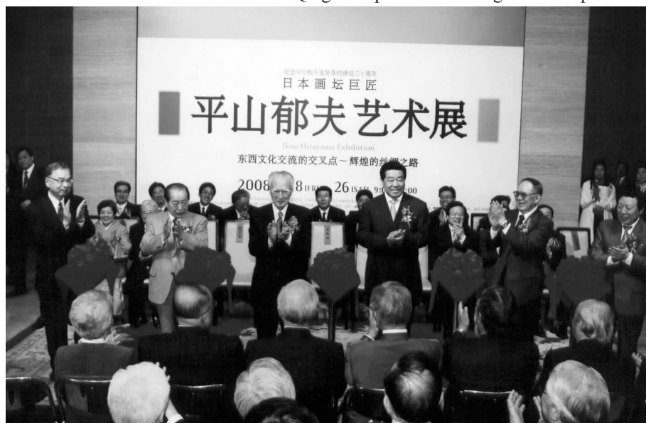
Jia Qinglin, chairman of the CPPCC National Committee, Tomiichi Murayama, former Japanese prime minister, and other Chinese and Japanese distinguished guests cutting the ribbon for the opening of the Ikuo Hirayama Painting Exhibition

Tomiichi Murayama expressed his thanks to Chairman