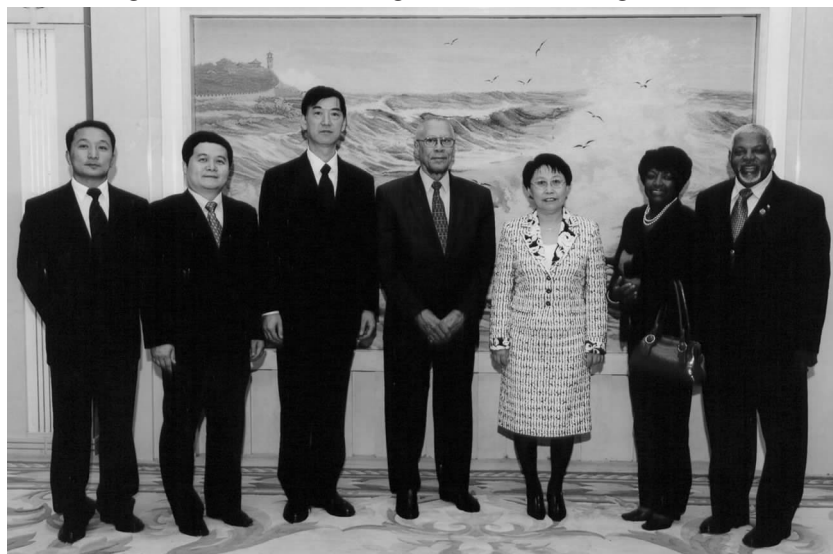
Uyunqing (L.5), vice chairperson of the NPC Standing Committee, meeting with Bahamas Deputy Governor General Sir Arthur Foulkes (L.4) and his party

Sir Arthur Foulkes reiterated that the Bahamian government will continue to adhere to the One-China principle. He believed that different nations should respect each other's sovereignty and the principle of non-interference in the internal affairs of another country. Most countries in the Caribbean region regard China as a friend and the Caribbean Community (CARICOM) has consensus on the One-China principle. China is a true friend of the Ba-