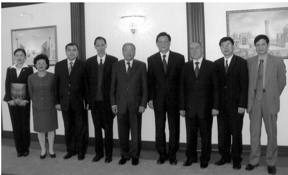
Uzbek Deputy Prime Minister Rustam Kasimov (centre) meeting with the delegation

Kazakhstan, and Serik Seidumanov, vice mayor of Alma-Ata, met with the delegation on separate occasions.