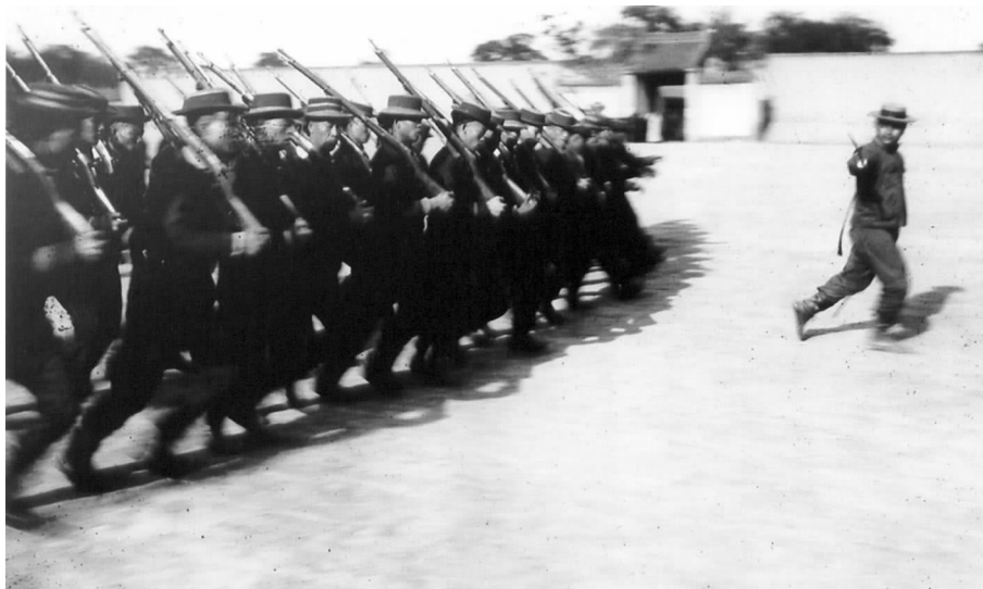
Infantry Drill at Xi'an

for their future study and research. Huang Teng, president of the Xi'an International University, fully affirmed the values of these photos, saying, "The displayed photos with excellent pictures and texts, which vividly and truly reflect the natural scenery and folk customs in western China at the end of the Qing Dynasty, have high historic and cultural values. They not only show us what the old China looked like from a foreigner's unique perspective, but also enable us to see and appreciate the tremendous changes of our great motherland over the past century." The Shaanxi TV Station and other media gave a special coverage of the exhibition. □