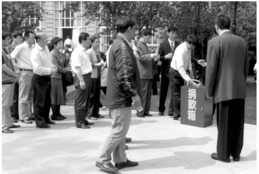
CPAFFC staffers making donations for the earthquake-hit areas

All present watched CCTV's live broadcast programme on the relief and rescue efforts at the epi-