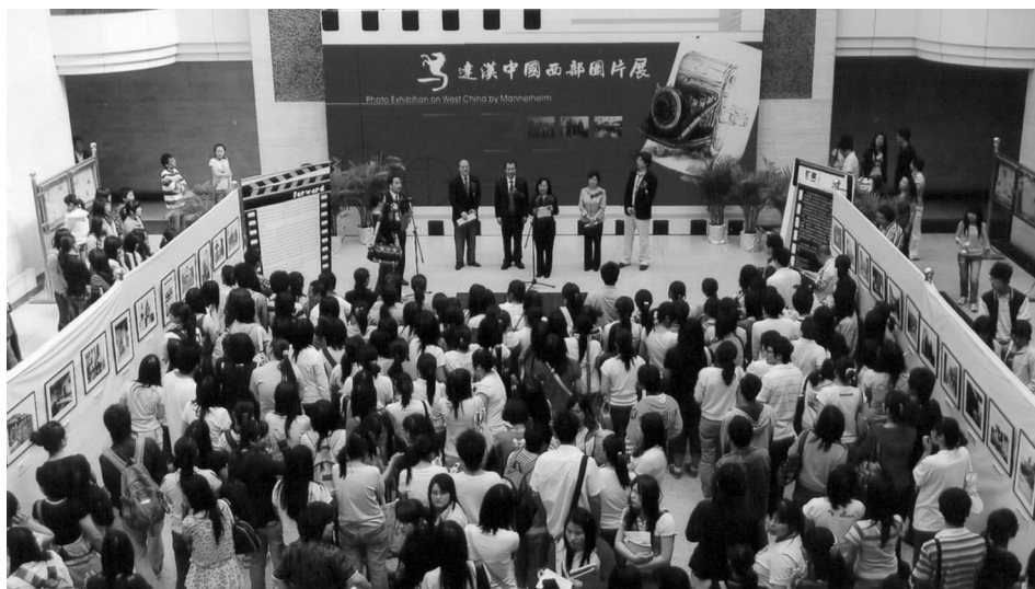
The opening ceremony held in the Xi'an International University