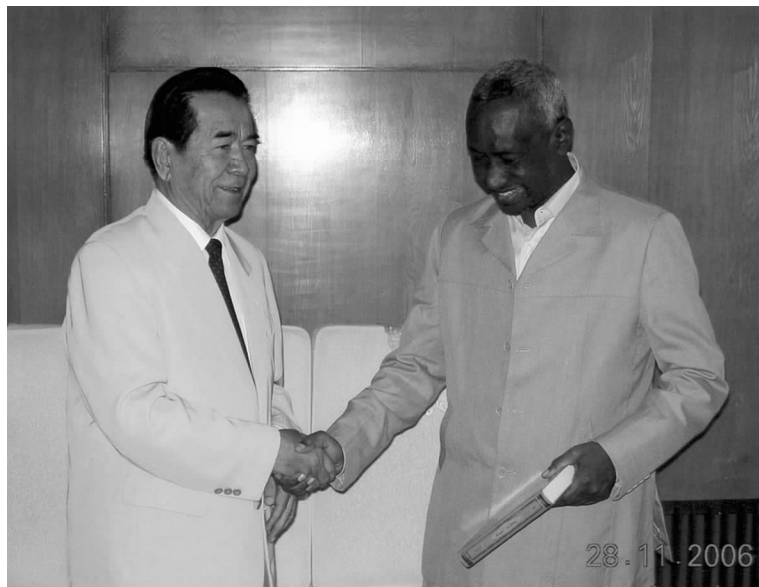
Sudanese Vice President Ali Osman Taha meeting with CAFA President Tomur Dawamat

The first China-Arab Friendship Conference sponsored by the China-Arab Friendship Association (CAFA) and the League of Arab States (LAS), supported by the foreign ministries of China and Arab countries and organized by the Sudanese Council for International People's Friendship