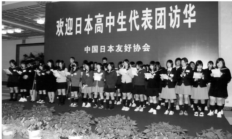
The Japanese students performing a chorus at a get-together with the Chinese students in Beijing