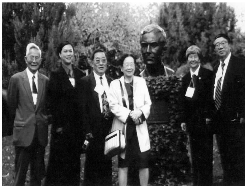
The delegation in front of the bust of Edgar Snow