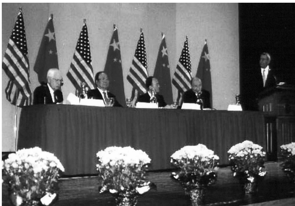
Rostrum of the 12th Edgar Snow Symposium