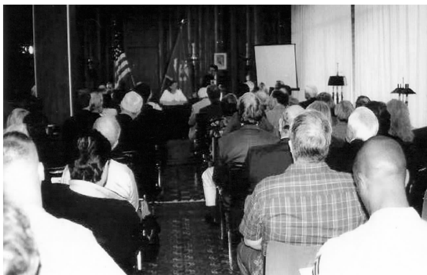
The meeting in commemoration of Evans. F. Carlson in session

O n the occasion of the 110th anniversary of the birth of American Brigadier General Evans F. Carlson, an old friend of the Chinese people, at the invitation of Furman University in Greenville, S. C. , University of South Carolina, Columbia, and family members of Evans Carlson, a delegation of the Chi-