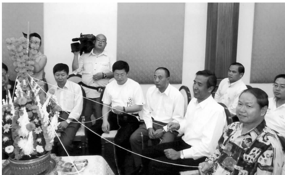
Members of the China-ASEAN Friendship Tour at the thread-tying ceremony held by the Lao-Chinese Friendship Association

It was the first large scale nongovernmental activity for friendship with the ASEAN countries in coordination with the celebrations held by the governments. Their motorcade traveled through the ASEAN member countries, covering 10,000 kilometres in 25 days. Along the route they carried out various cultural, economic and trade exchanges and made philanthropic donations. They came into close contact with a great number of