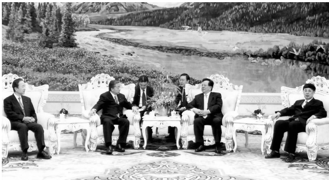
Vice President Zeng Qinghong meeting with Japanese young Dietmen's delegation