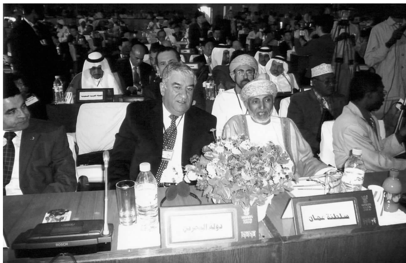
Representatives of friendship organizations of Arab countries at the opening session of the China-Arab Friendship Conference

The first China-Arab Friendship Conference, one of the activities held by the CPAFFC and the CAFA in celebration of the 50th anniversary of the beginning of diplomatic relations between new China and Arab countries, was attached great importance to by the participating countries. China sent a 35-member CAFA delegation headed by Tomur Dawamat, former vice chairman of the Standing Committee of the National People's Congress and president of the CAFA, and composed of representatives of the Foreign Ministry, the CAFA, the Chinese People's Institute of Foreign Affairs, and leading members of 16 provincial and municipal people's associations for friendship with foreign countries. On the Arab side, about 150 people including leading members and representatives of the friendship-with-China orga-