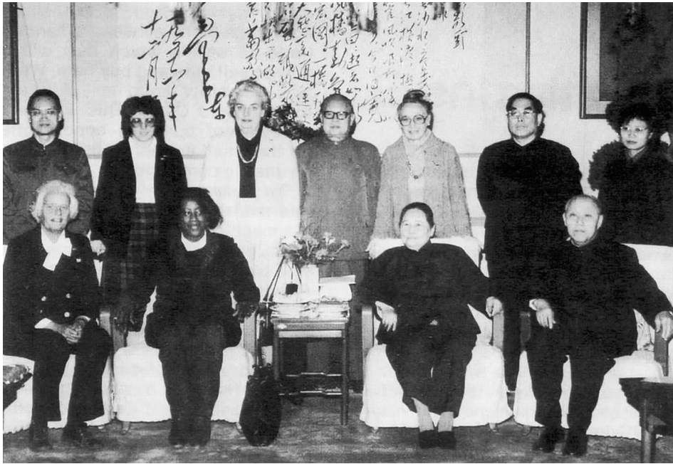
Chinese Vice President Soong Ching Ling meeting with Unita Blackwell and her party in 1980

international peacemaker and presidential advisor, the reader encounters all the unlikely turns of Unita's remarkable life. The lessons she shares affirm and motivate us all, whether it's to remember that ordinary people can do extraordinary things, that world-changing movements are the result of many small steps, or that freedom means taking responsibility for our own lives and helping to make the world a better place for all. In a word, without doubt, Barefootin' is not only a stirring memoir of an exceptional woman but also a guide to living a full and meaningful life from someone who knows how. As Marian Wright