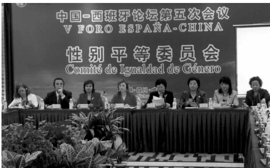
The meeting of the Committee of Equality in session

China-Spain cooperation and affirms the positive role played by the CSF in promoting and invigorating exchanges and cooperation between the two countries in various fields. It holds that the CSF is an important mechanism in China-Spain relations and a supplement to the bilateral governmental cooperation, and stresses that both sides are willing to make concerted efforts to push forward the development of China-Spain comprehensive strategic partnership to a higher and deeper level. It highly praises and pays tribute to Hu Qili, chairman of the Forum's Chinese Committee, and Juan Antonio Samaranch, chairman of the Forum's Spanish Committee, for their outstanding contribution to the establishment and development of the CSF. It is decided in the conclusive document that from 2009 on the CSF will be held once every two years, that between sessions, if need be, the sub-committees can carry out relevant activities through consultation between the two sides, and that the Secretariats of the two sides will hold regular working meetings according to the needs to implement the forum's resolutions and promote the cooperation projects.