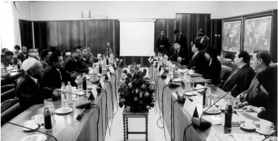
Abdul'ahat Abdulrixit, vice chairman of the CPPCC National Committee and president of the CAP-FA, and his party having a meeting with Degefe Bula, speaker of the House of Federation of Ethiopia

friendship with the three countries and the Chinese Government attaches great importance to developing relations with them. In recent years, China and the three countries have kept frequent high-level exchanges. The mutual political trust between them has been enhanced, and the cooperation in economy, trade and other areas has been fruitful. They have supported each other and collaborated closely in international affairs. China thanks and appreciates the consistent support given by the leaders of the three countries on the issues concerning China's core interests.