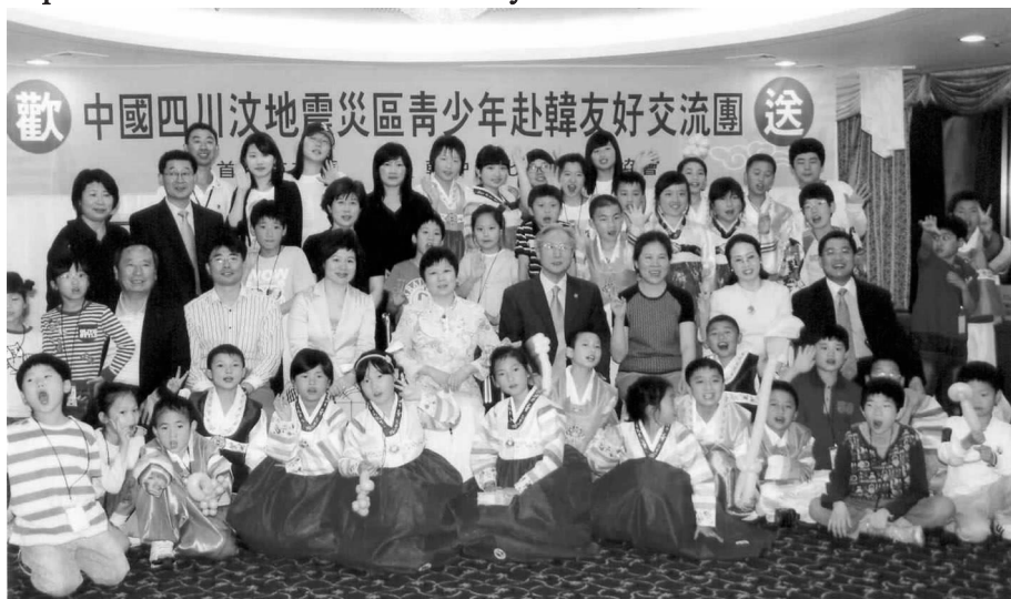
The delegation at the seeing-off party given by the Korea-China Friendship Association of Culture and Economy

The KCFACE arranged for the children many activities such as skiing in an indoor ski ground, visiting a children's park to have close contact with various kinds of small animals, visiting a science and technology museum, a boat trip on the Han River and a visit to Lotte World, one of the largest indoor amusement parks in the world. The children's optimistic attitude towards life, their ability to take care of themselves and their spirit of caring for and co-operating with each other moved the personages of various social circles in the ROK. The Chinese and ROK children with their honest and pure hearts touched everyone, from the President down to ordinary people. □