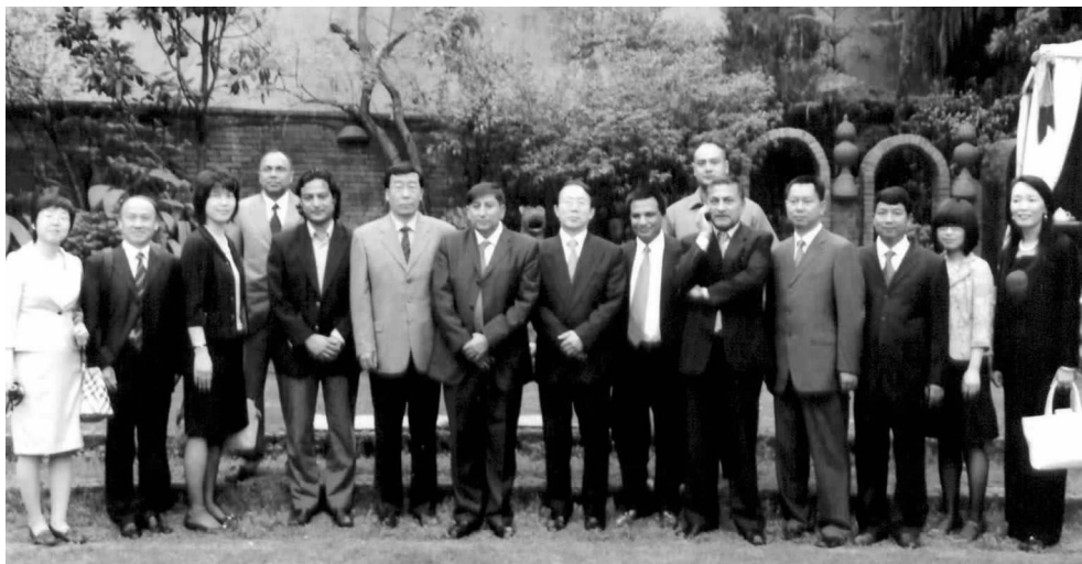
The delegation with friends of the Nepal China Executives Council

Speaking highly of China-Nepal and China-Bangladesh relations. In his meeting with the delegation, Krishna Bahadur Mahara, Nepalese minister of information and communications, spoke highly of the friendly relations between the governments, political parties and peoples of the two countries. He said, China is the friendliest neighbour of Nepal. China has always strictly abided by the Five Principles of Peaceful Coexistence and never interferes in the internal affairs of other countries. It respects and supports the Nepalese people's own choice and decision. The Nepalese Government and people appreciate it very much. He continued, Nepal and China have