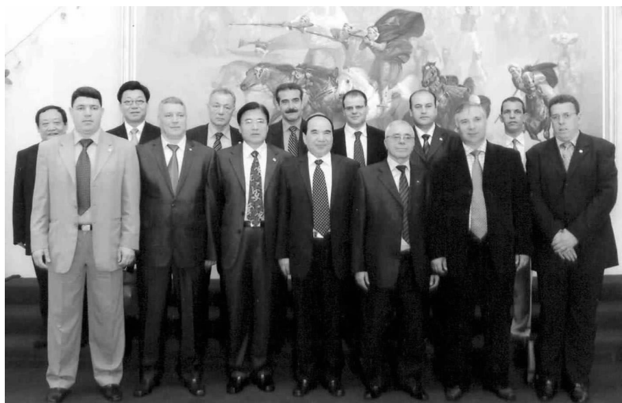
President Said Bouhadja and other members of the Algero-Chinese Parliamentary Friendship Group of the People's National Assembly of Algeria with the delegation