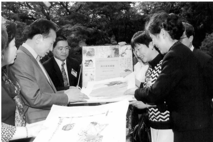
CPAFFC Vice President Li Xiaolin presenting paintings by Sichuan artists to President and Mrs. Lee Myung-Bak

President Lee gave a touching speech. He said, in May last year I visited the quake-stricken areas when there were still aftershocks. The scene in the disaster areas was very miserable. There is a common saying in the ROK: "the closer friends we are, the more we should help each other in times of difficulty." The ROK is China's good neighbour. When China is in difficulty, we will definitely lend a helping hand.