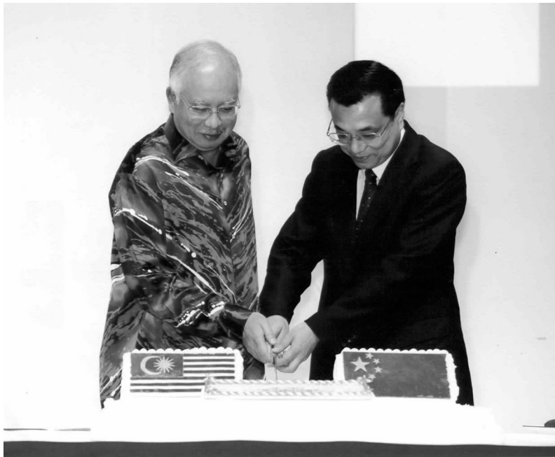
Chinese Vice Premier Li Ke-qiang and Malaysian Prime Minister Najib Tun Razak cutting the cake at the event

with the international financial crisis and implement the Joint Action Plan on China-Malaysia Strategic Cooperation to bring about a better future for bilateral relations by enriching the contents, opening up new fields and elevating the level of their strategic cooperation.