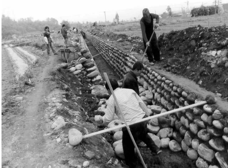
Farmers repairing irrigation channels in Pengzhou County, Sichuan

This project will work in two areas to develop co-operatives; in Danjingshan Township to assist with the development of a tea industry and in the three villages communities of Paifang Vegetable Cooperative where the irrigation channel repair