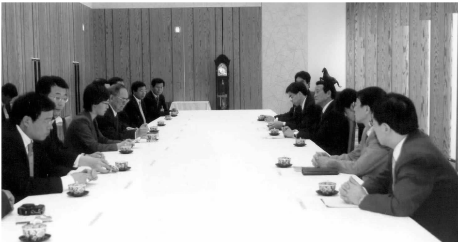
Japanese Prime Minister Taro Aso meeting with the delegation

ing”, “ice-thawing”, “spring-heralding” and “warm-spring” visits by the leaders of the two countries, witnessed a significant development and great breakthrough. Recently, through frequent meetings, the leaders of the two countries reached a number of important agreements on Sino-Japanese friendly cooperation, which has promoted the further growth of Sino-Japanese friendly relations. Now China and Japan have entered a new phase of all-round promotion of the strategic and mutually beneficial relations with new opportunities for accelerated development. However, we also should see soberly that there still exist some weak links in the Sino-Japanese relations and the friendly feelings between the two peoples are relatively fragile, hence the