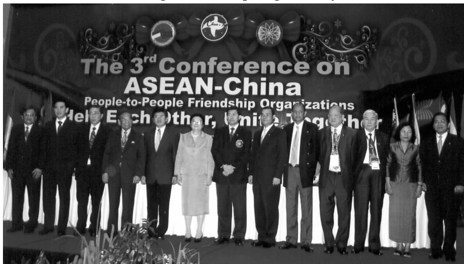
Leaders of all the delegations at the opening ceremony of the conference

During the conference an exhibition of Chinese and ASEAN commodities was held. More than 20 economic and trade companies