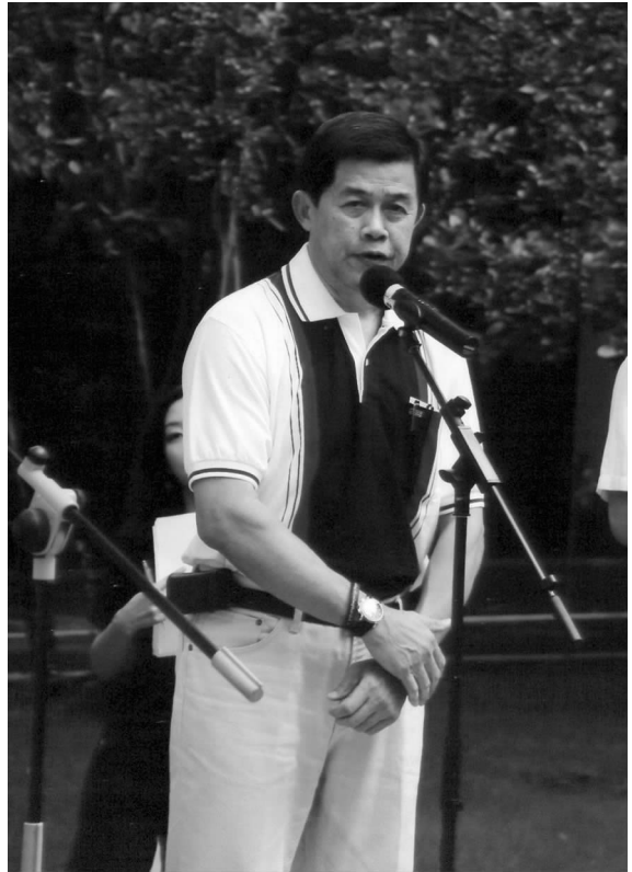
Korn Dabbaransi, president of the Thai-Chinese Friendship Association and former Thai deputy prime minister, speaking at the bell-ringing ceremony