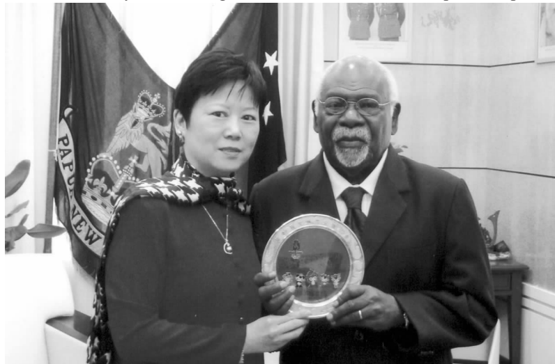
PNG Governor General Paulius Matane (right) meeting with CPAFFC Vice President Li Xiaolin

All the members of the delegation led by Li Xiaolin immediately participated in the local people's collection of donations for the stricken areas and mourning the victims of the earthquake. When meeting with the delegation, the governor general of Papua New Guinea, the Vanuatuan president, prime minister, speaker of the Representative Assembly and foreign minister and the vice foreign minister of New Zealand, all expressed their sincere sympathy and solicitude for the people of the disaster areas in China. On May 19, in the Chinese Embassy in Vanuatu, together with all the people at home the delegation paid silent tribute to the victims of Wenchuan earthquake. In Port Vila on May 20, the delegation took part in the collection of donations held by the Chinese community in Vanuatu. Chinese Ambassador to Vanuatu Cheng Shuping and his wife, Vanuatuan President Kalkot Matas Kelekele and his wife, Speaker of the Representative Assembly Sam Dan Avok and his wife, Vanuatuan Ambassador to China Lo Chi Wai, diplomatic envoys in Vanuatu and representatives of overseas Chinese and Chinese Vanuatuan, among over 200 people, participated in the activity. CPAFFC Vice President Li Xiaolin gave a speech expressing her thanks to the personages of