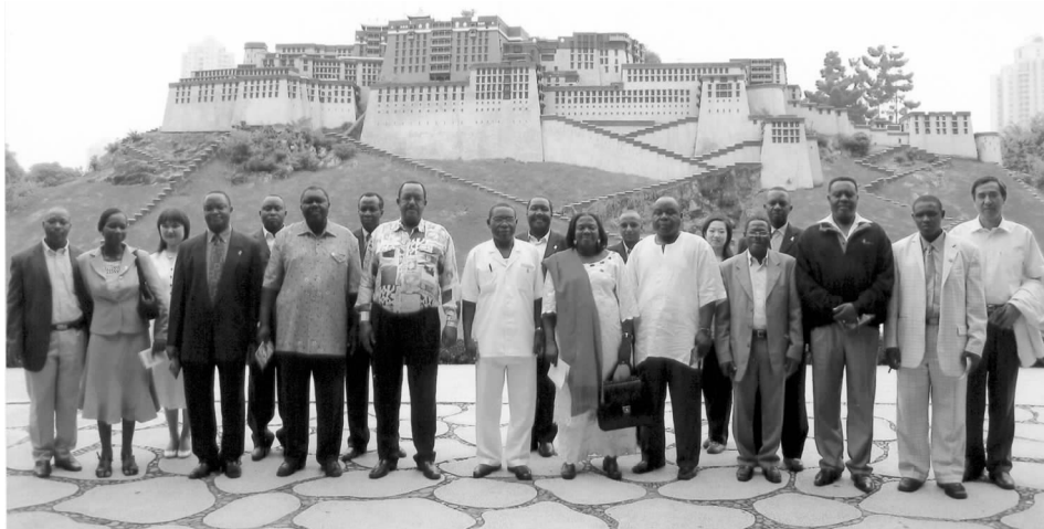
The delegation at the Splendid China Folk Culture Village in Shen- zhen

struct the network of communication in the EAC. The EAC and China Gezhouba Group Corporation signed the Memorandum on the Framework of Cooperation in Energy and Infrastructure Construction. □