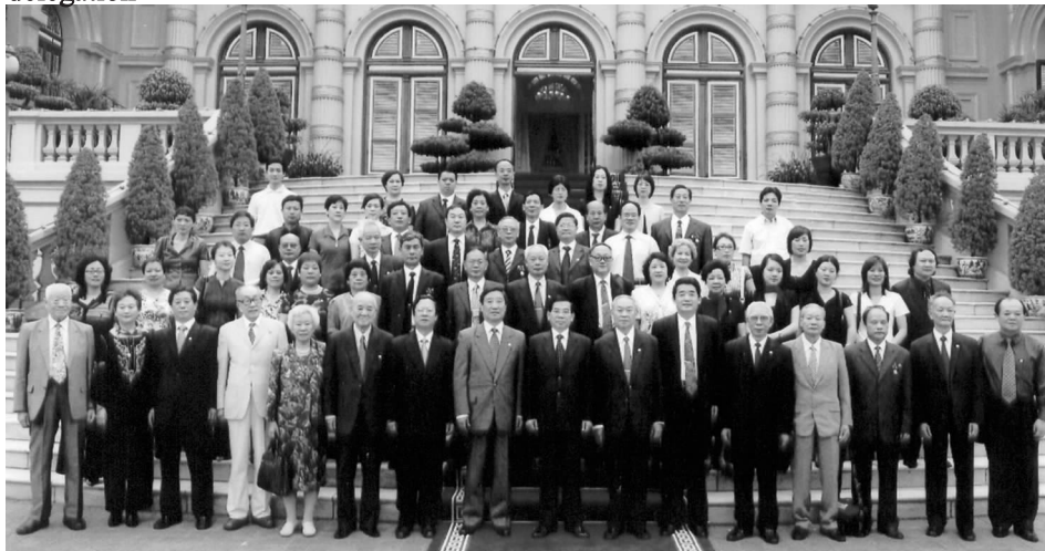
Vietnamese President Nguyen Minh Triet (L.9 in the front row) meeting with the delegation

great contributions to the Vietnamese revolution and Vietnam-China friendship. This activity organized on the occasion of the 118th birthday of Chairman Ho has a far-reaching significance, and reflects the Vietnamese people's fine tradition of "remembering past kindness and reciprocating the kindness received". He stated, the CPV and the Vietnamese government and people will forever remember the long-term support and aid given by the Communist Party of China and the Chinese government and people for the Vietnamese revolution. Vietnam attaches great importance to developing relations with China. Regular exchanges of visits by high-ranking leaders of the two countries have promoted bilateral cooperation. In the new era, Vietnam and China will ad-