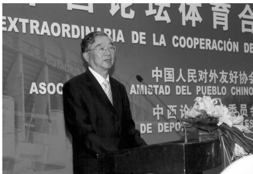
Hu Qili, chairman of the China-Spain Forum's Chinese Committee, speaking at the opening ceremony

desire of mankind for friendship, peace and cooperation and the Olympic