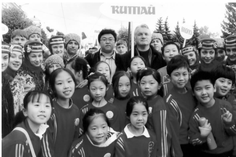
The China Children's Art Troupe with children from other countries taking part in the Third International Children Festival of Folk Choreography

placed flowers before the Monument to Revolutionary Martyrs in a solemn atmosphere. In the following Victory Day parade, we saw dozens of young soldiers guided by a national flag bearer holding ensigns of the Ukrainian First, Second, Third and Fourth Front Armies during the Great Patriotic War and red flags march at the front row of the paraders, followed by veterans wearing medals for military merits. They waved greetings to the spectators on the roadside from time to time. When a veteran with outstanding military exploit appeared in a