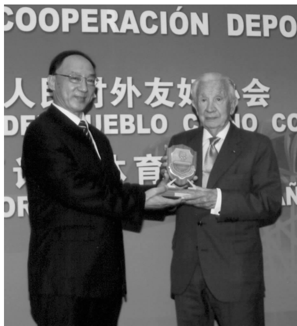
Liu Peng, president of the Chinese Olympic Committee (COC) and director of the General Administration of Sport, presenting the Decoration of Supreme Honour of the COC to J. A. Samaranch, honorary life president of the International Olympic Committee

Liu Peng, president of the Chinese Olympic Committee, presented to Honorary IOC President Samaranch a Decoration of Supreme Honour of the COC, the first medal ever awarded by the COC, to express heartfelt gratitude to and high respect for him. Samaranch has been concerned for and supports the development of sports in China. He has played a major role in China's return to the Olympic family and made great contributions to China-Spain sports cooperation. CSF Chinese Committee Chairman Hu Qili said in his opening speech: "Mr. Samaranch has a heart of gold and a friendship deep as the sea for the Chinese people. His words, his deeds and his moral integrity are the