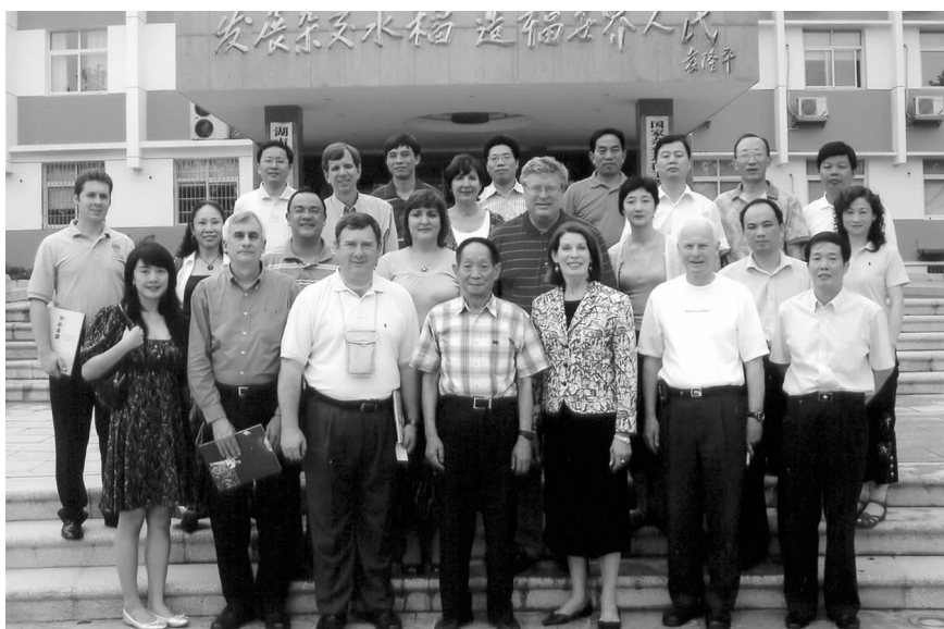
The delegation with Academician Yuan Longping (middle in the front row) known as “father of hybrid rice” after visiting the Hunan Hybrid Rice Research Centre

ue to strengthen its contacts with the Chinese NPC and further enhance mutual understanding and trust to ensure a steady and healthy development of bilateral relations.