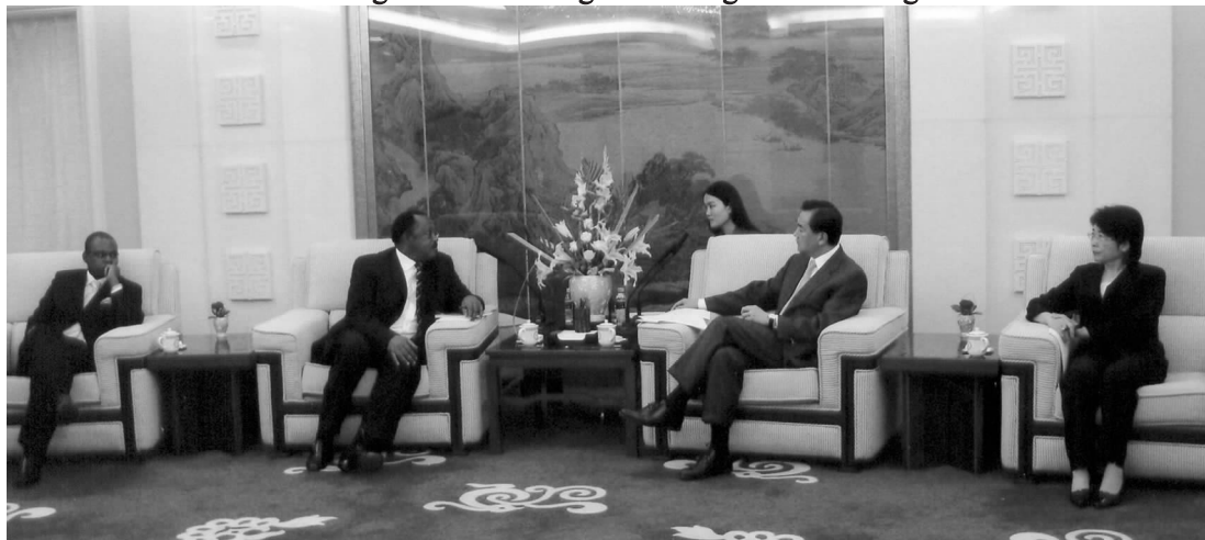
Vice Foreign Minister Wang Yi meeting with the delegation

He said, China keeps friendly relations and close cooperation with the EAC five member countries. This time the five countries, as a whole, visit China hoping to deepen cooperation with China. He held, a single country is not potent enough to attract large investment. The EAC has set up a platform of common development for its five members, which will help attract large investment in their construction and realize common development. The EAC with rich natural resources has a lot of opportunities of investment and welcomes Chinese big companies and businessmen to make investments there. The delegation had talks successively with China Road and Bridge Corporation in Beijing, China Gezhouba Group Corporation in Yichang and Huawei Technologies in Shenzhen. The details of cooperation plan have not yet been discussed. The delegation hoped that Chinese companies would make