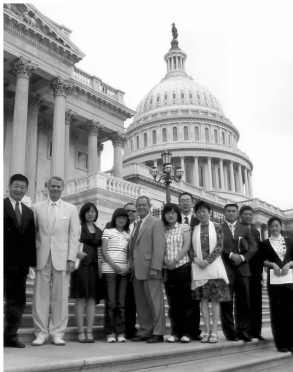
The delegation with US Congressman Joe Wilson

the earthquake on TV, but they did not get such moving stories showing the indomitable and selfless spirit of the Chinese people. Diane Watson, Democrat congresswoman from California, expressed her admiration of the great courage and strength demonstrated by the Chinese people in the earthquake.